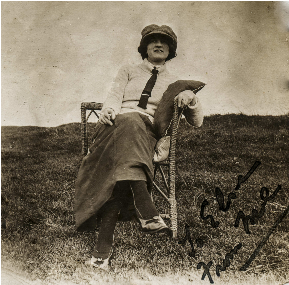
MPS-0004 - A chair at Trent Lock.