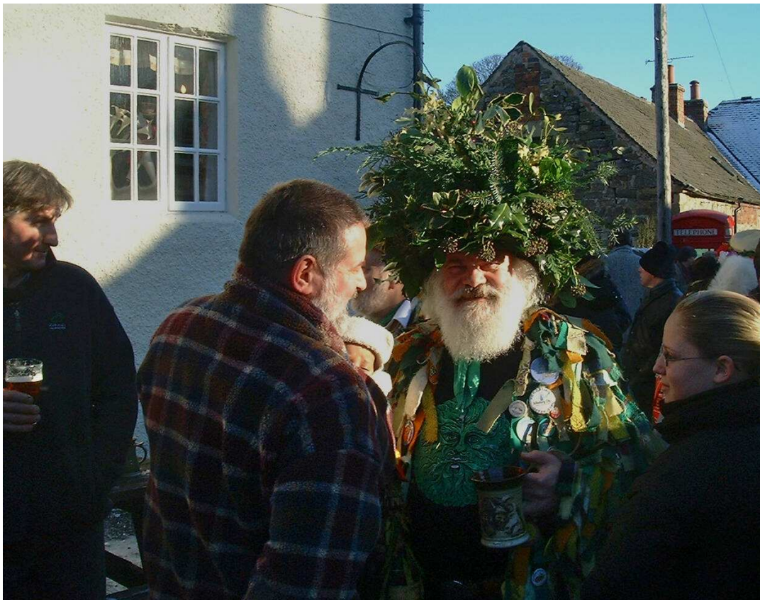
DSCF0024 - The Green Man

DSCF0024 0101 13:52 The Green Man 6.6 125 f7 1/137 DSCF0025 0101 13:59 Ripley Morris Side. 9.9 125 f3.3 1/208 DSCF0026 0101 14:01 Ripley Morris Side. 18 125 f3.3 1/97 DSCF0027 0101 14:01 The Fool, Ripley Morris Side. 18 125 f3.3 1/91 DSCF0028 0101 15:13 Rahel and Suzie 12.9 125 f7 1/181 DSCF0029 0101 15:14 Clifford, Joseph and Suzie 9.9 125 f7 1/239 DSCF0030 0101 15:14 Clifford, Joseph and Suzie 9.9 125 f7 1/256