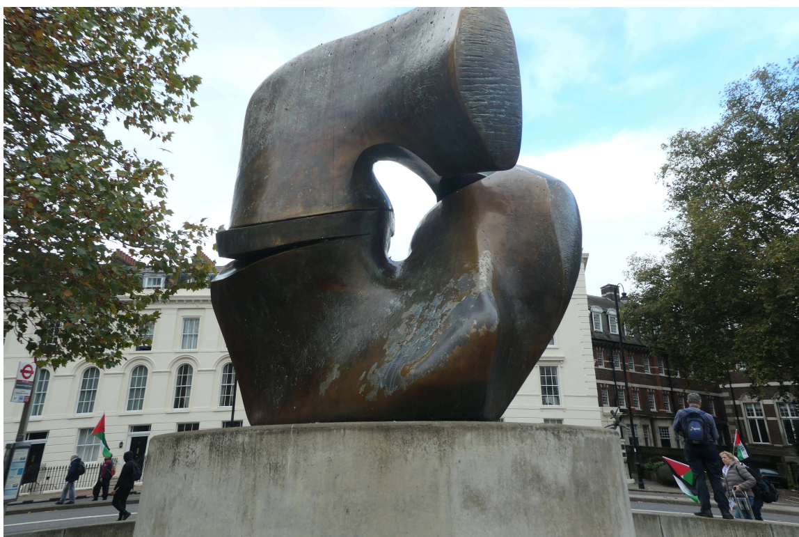
P1036446 - Locking Piece