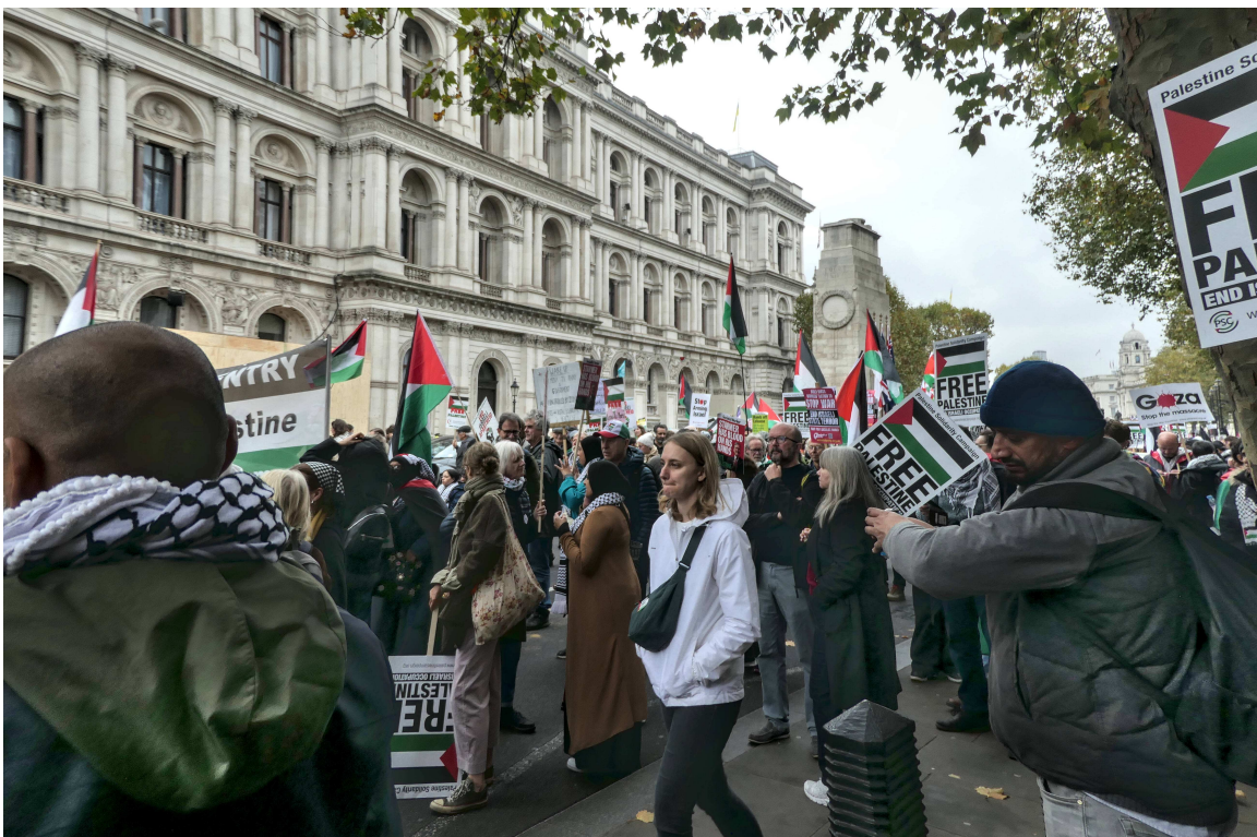
P1036419 - Stop the war.