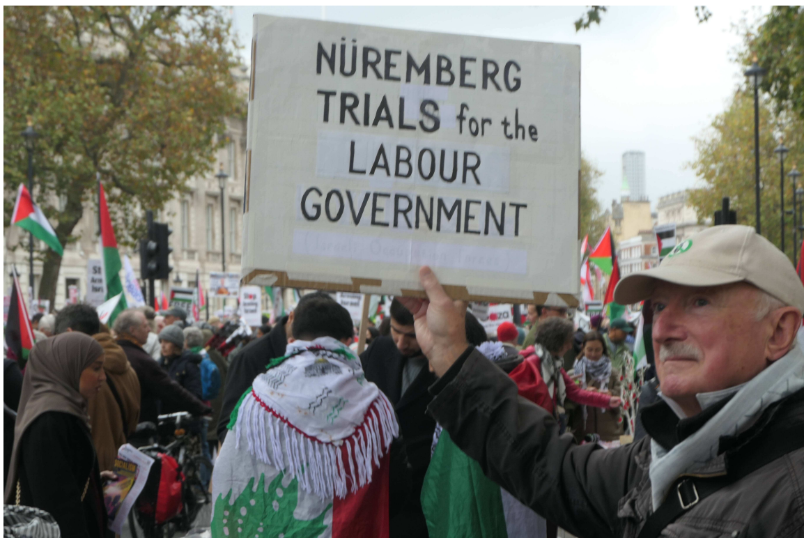
P1036416 - Nuremberg Trials for the LABOUR GOVERNMENT.