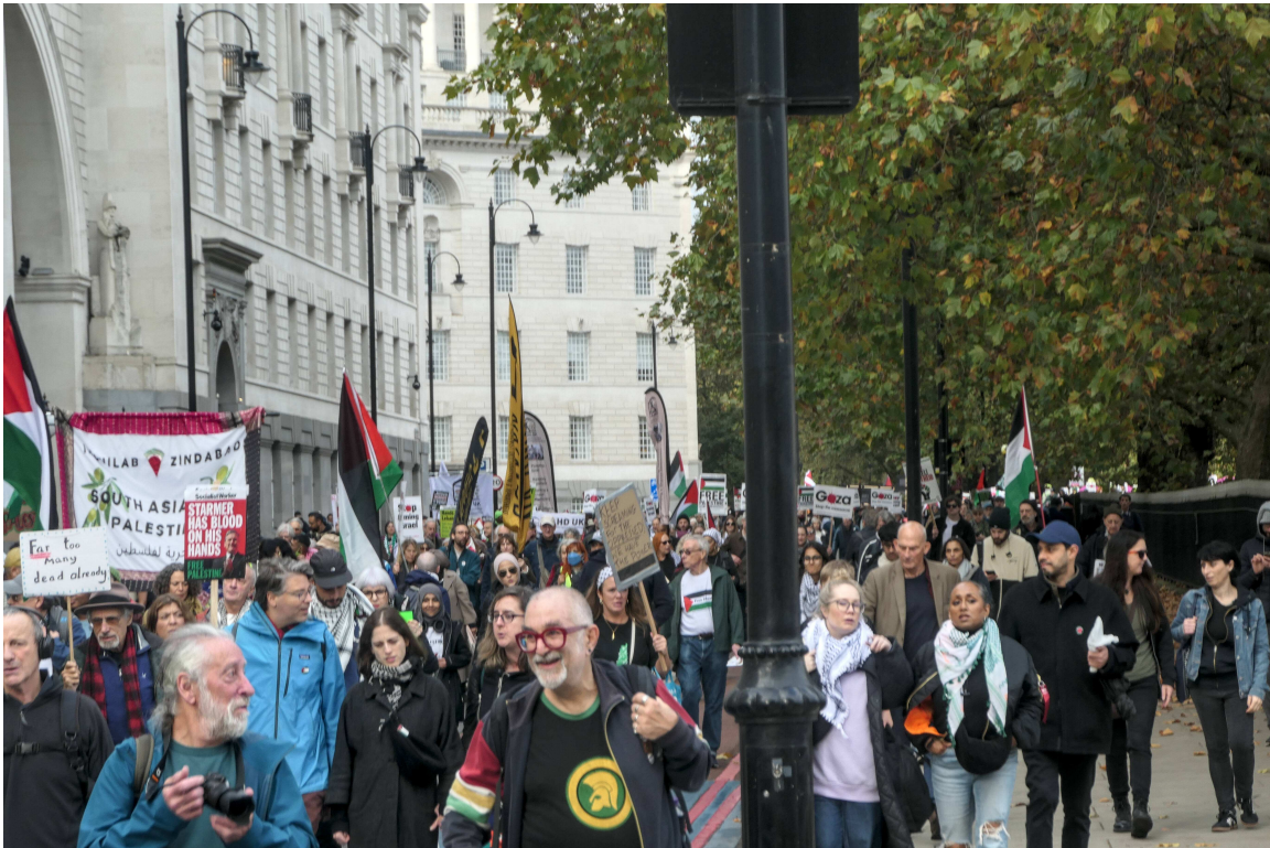
P1036435 - Starmer has Blood on his Hands - Stop the war.