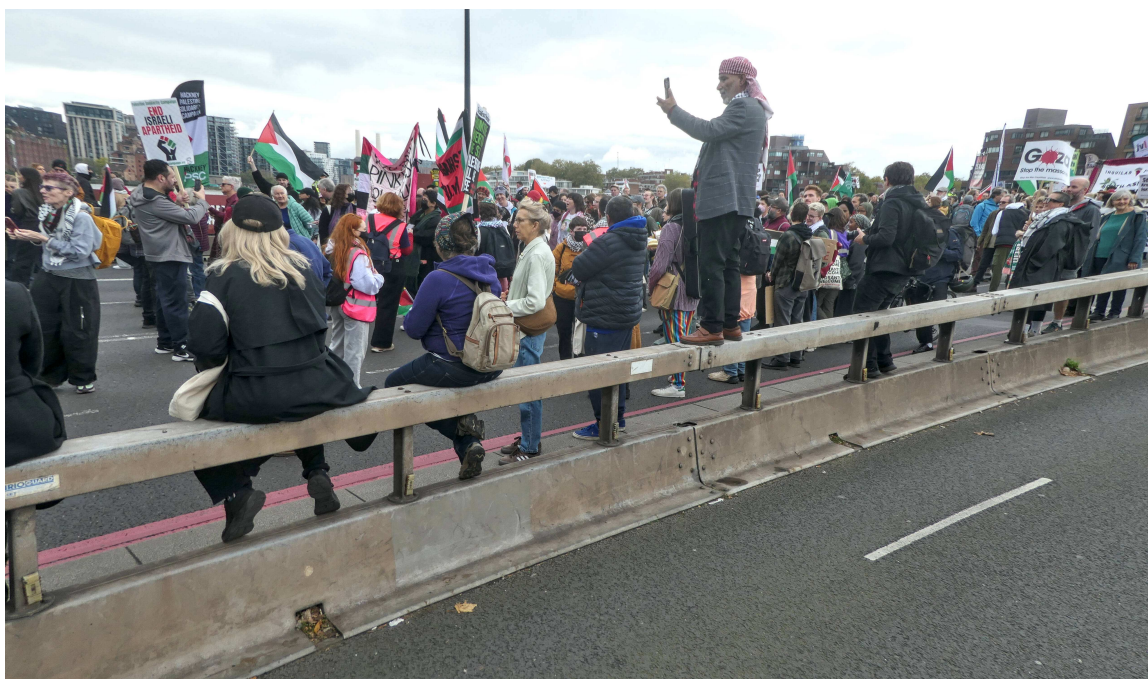
P1036454 - Capture the day.