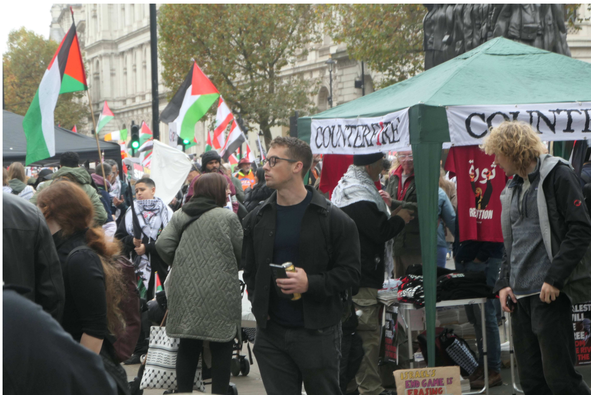
P1036411 - Stop the war.