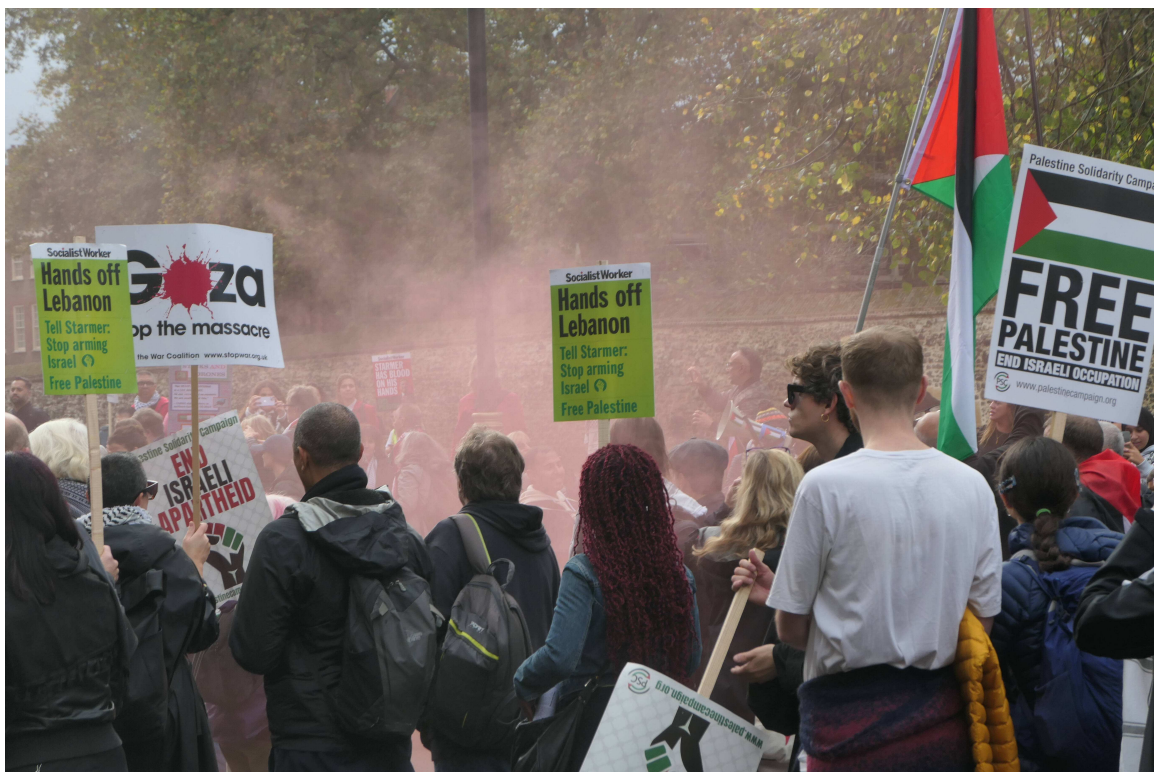
P1036425 - Hands off Lebanon.