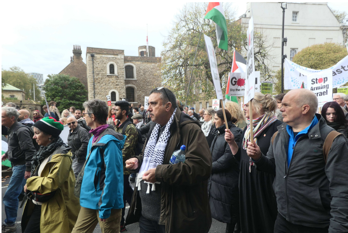
P1036429 - Stop the war.