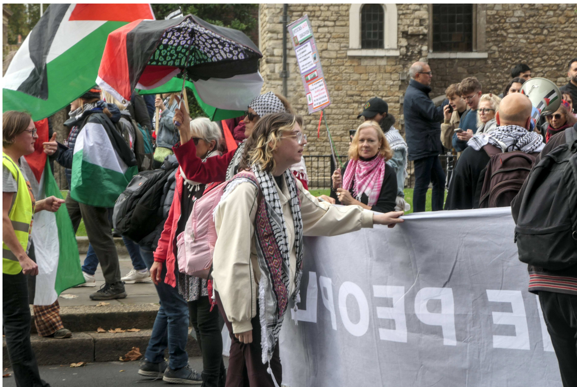
P1036427 - Stop Arming Israel.