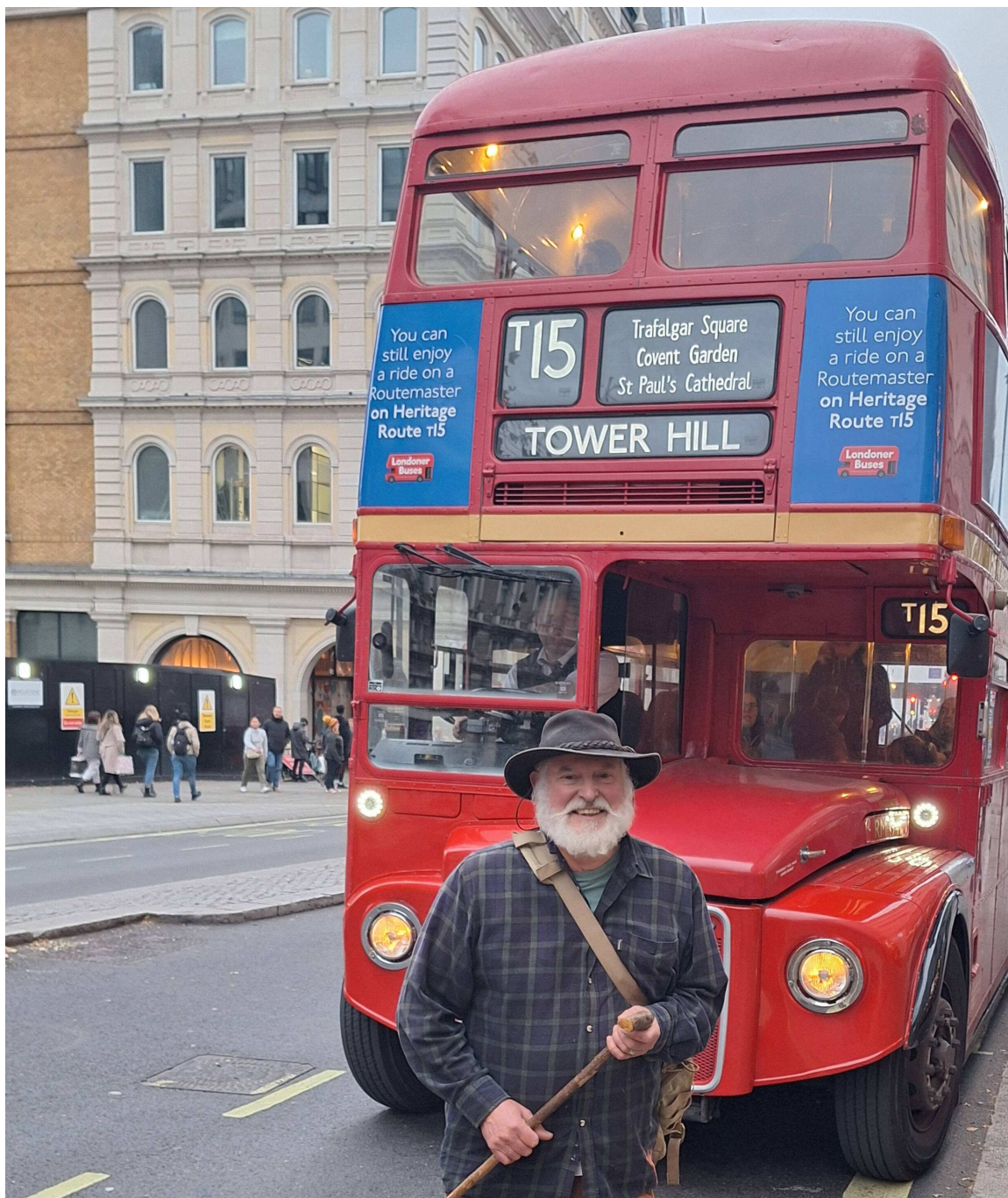
20241102_155408 - No. 15, Routemaster.