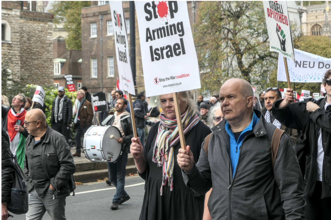
P1036432 - Stop Arming Israel.