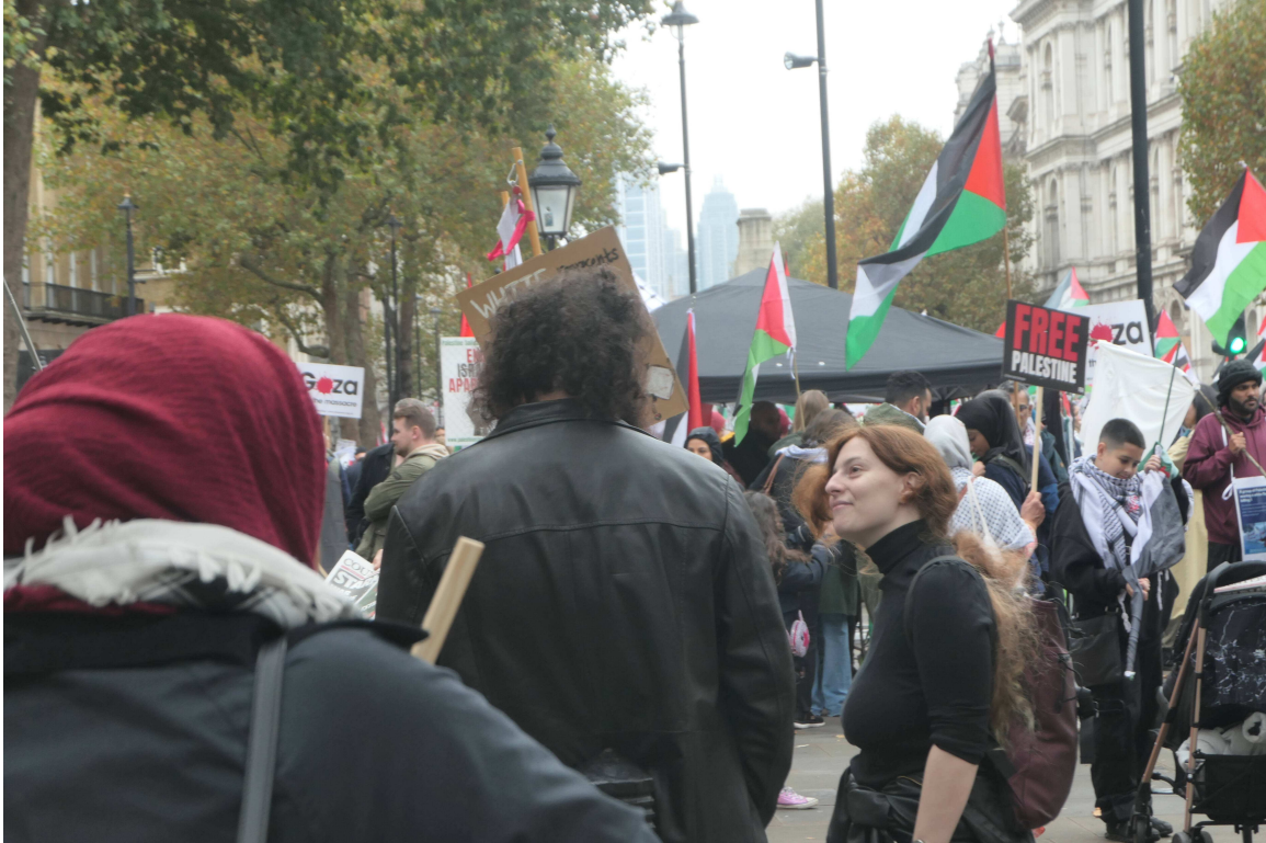
P1036412 - Stop the war.