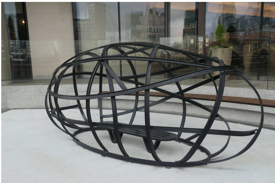
P1036448 - Only Children.