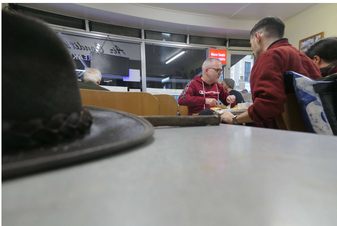
P1036461 - Kennington Lane Café