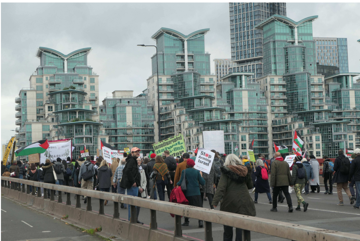
P1036451 - Stop the war.