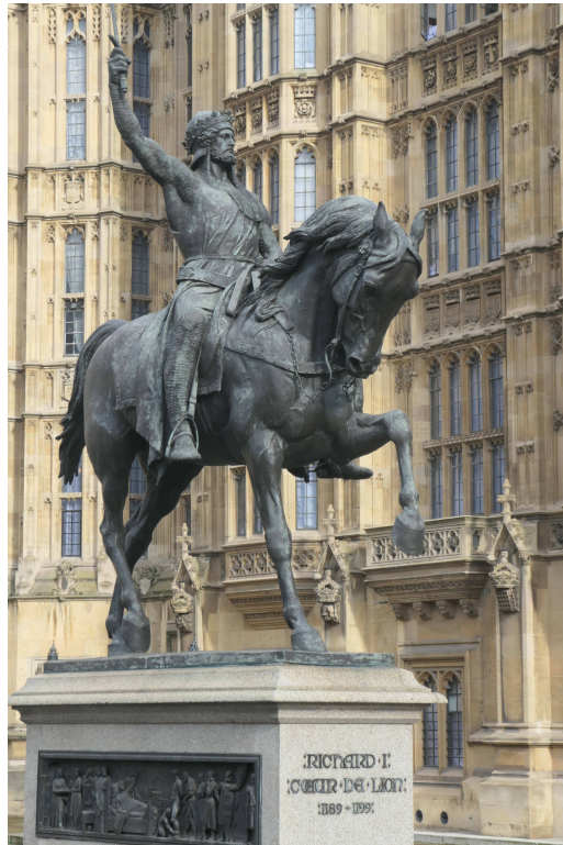
P1036424 - Richard I, Coeur de Lion