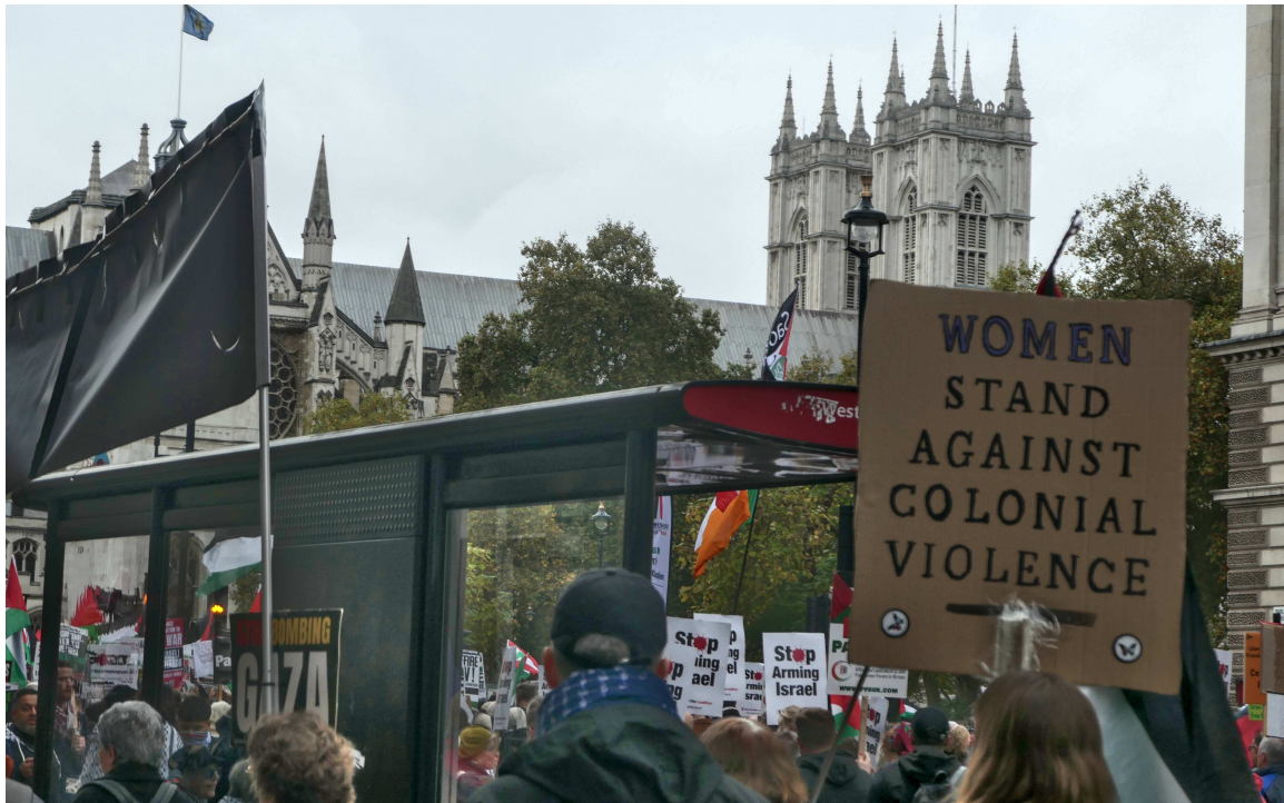
P1036421 - Women Stand against Colonial Violence - Stop the war.