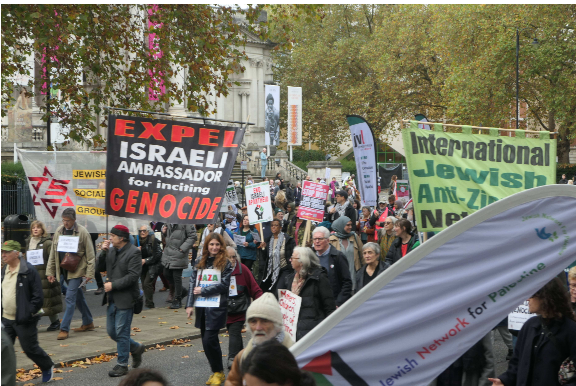
P1036438 - Jewish Socialist Group - Stop the war.