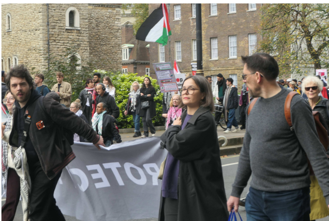
P1036431 - Stop the war.