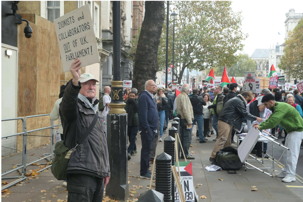
P1036415 - Zionists and Collaborators.