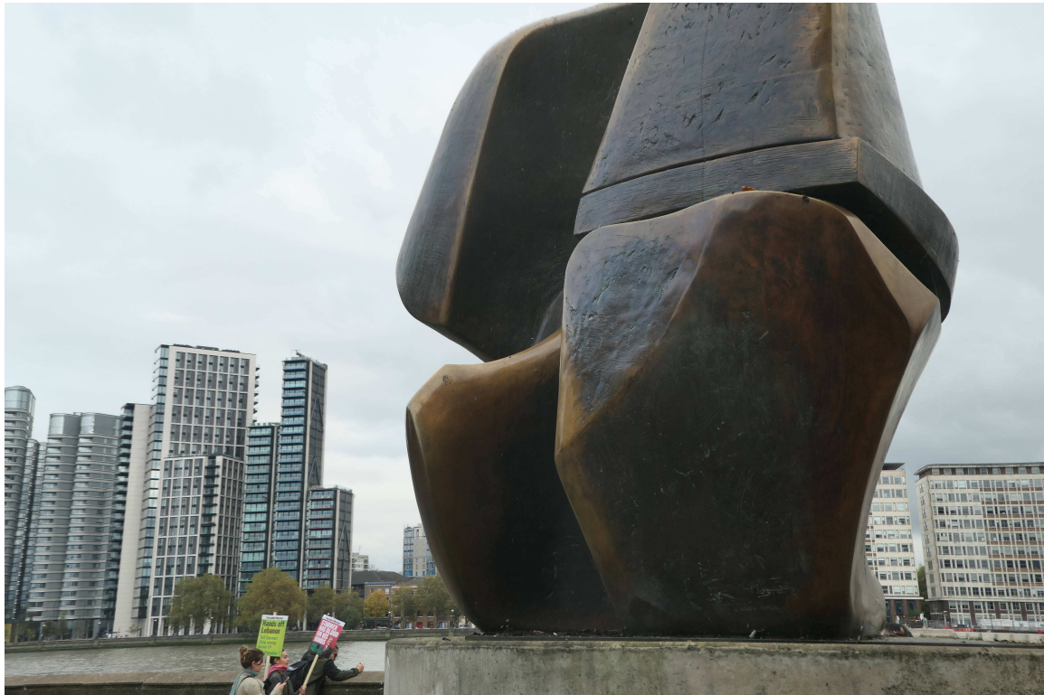
P1036447 - Locking Piece