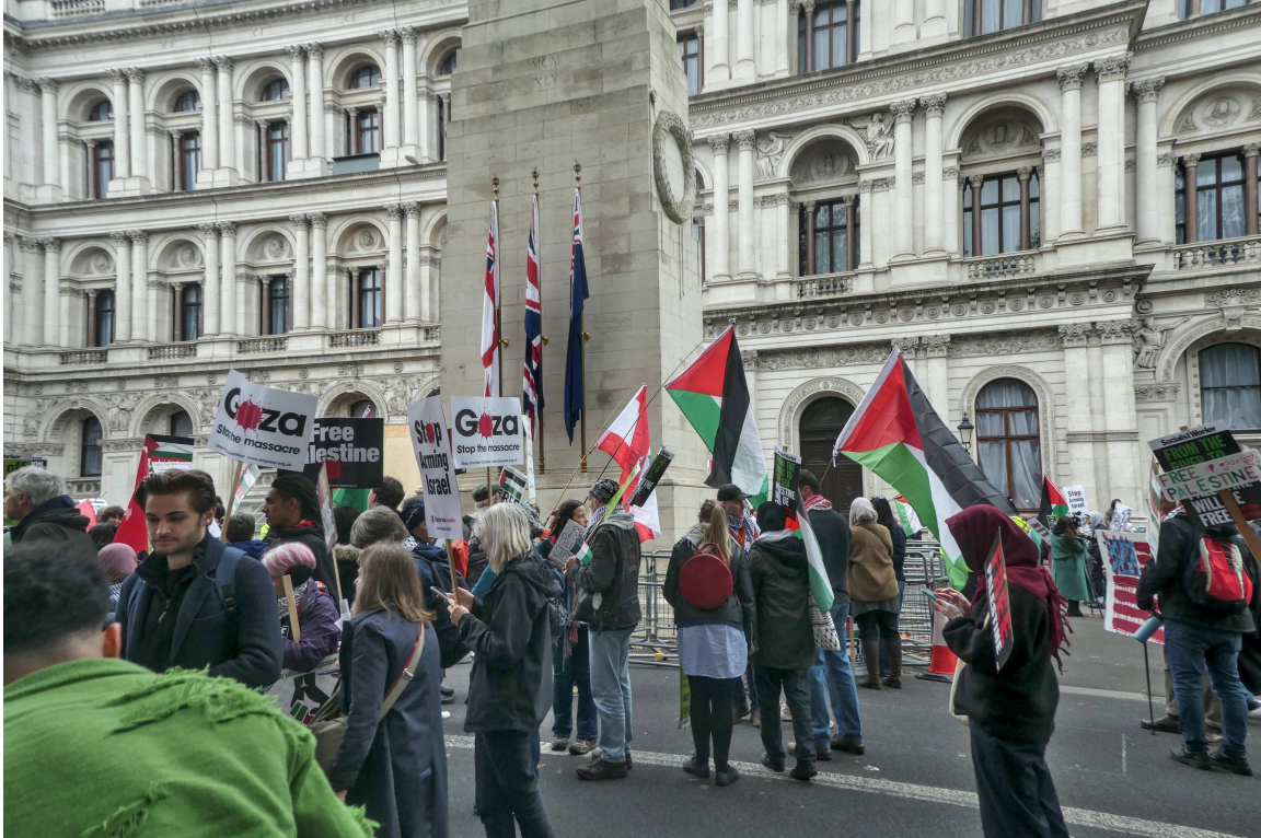
P1036417 - Nuremberg Trials for the LABOUR GOVERNMENT.