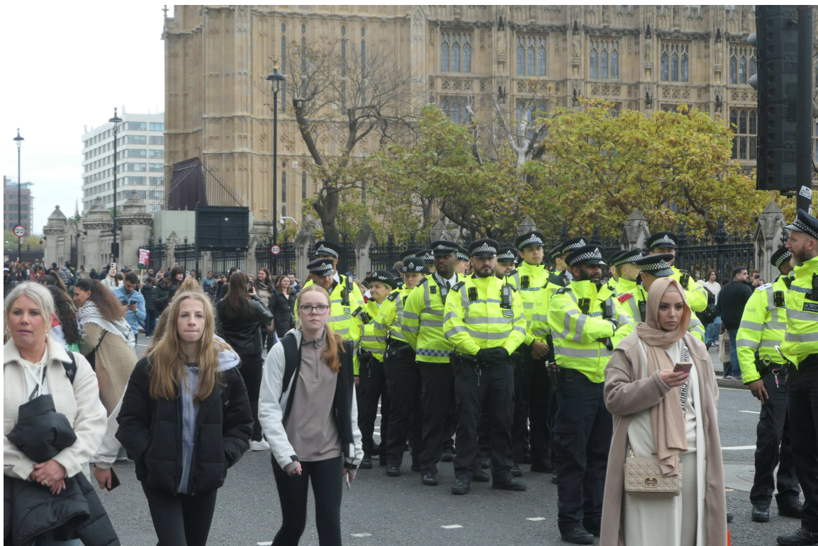
P1036422 - Stop the war.