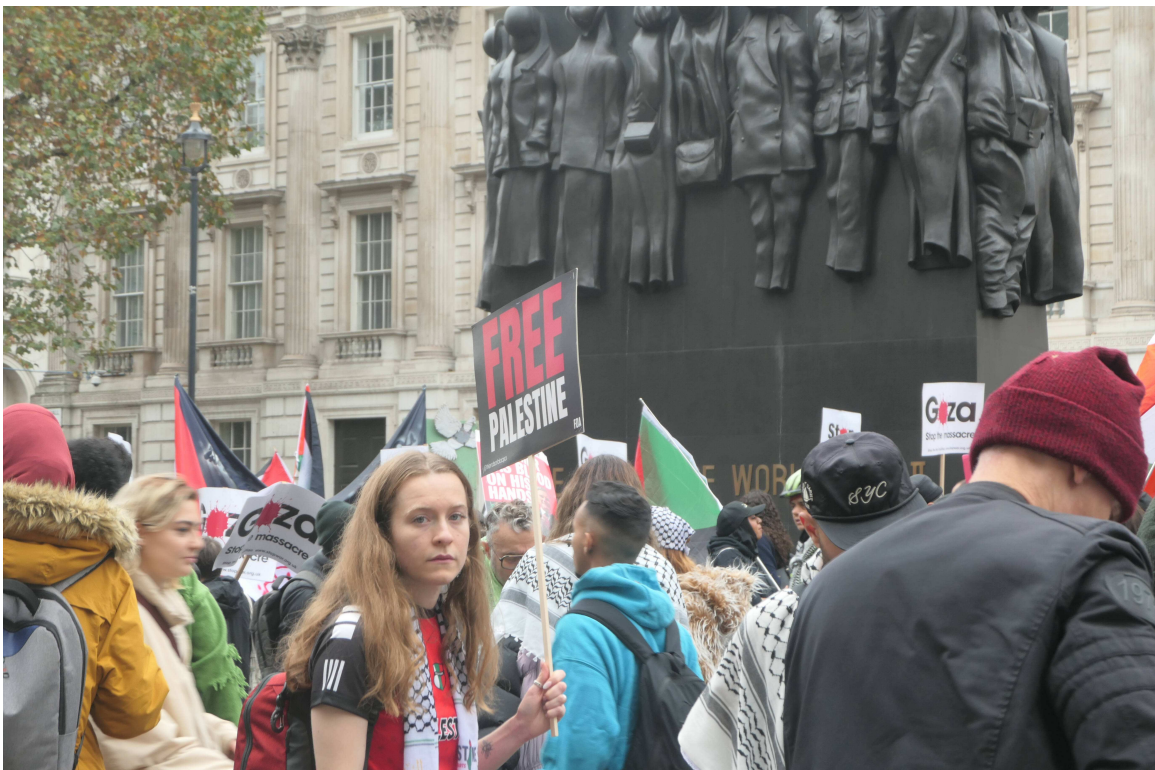
P1036413 - Stop the war.