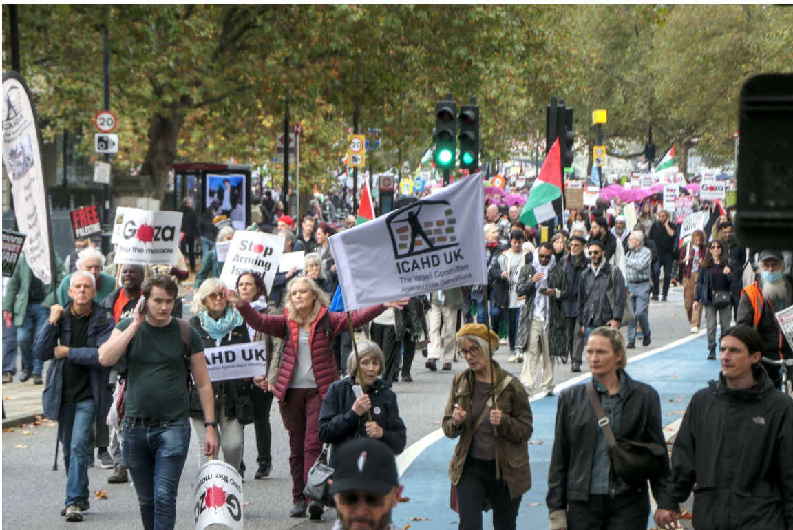
P1036442 - Stop the war.