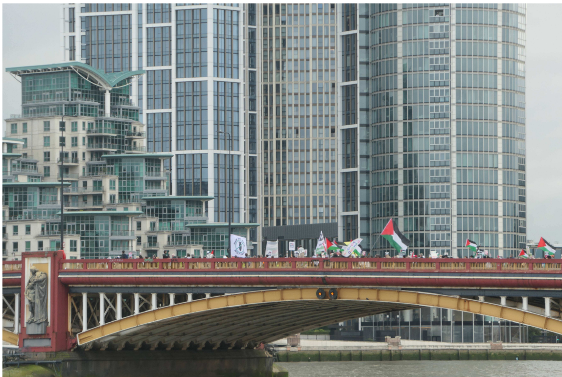
P1036444 - Vauxhall Bridge and St. George Wharf Development.