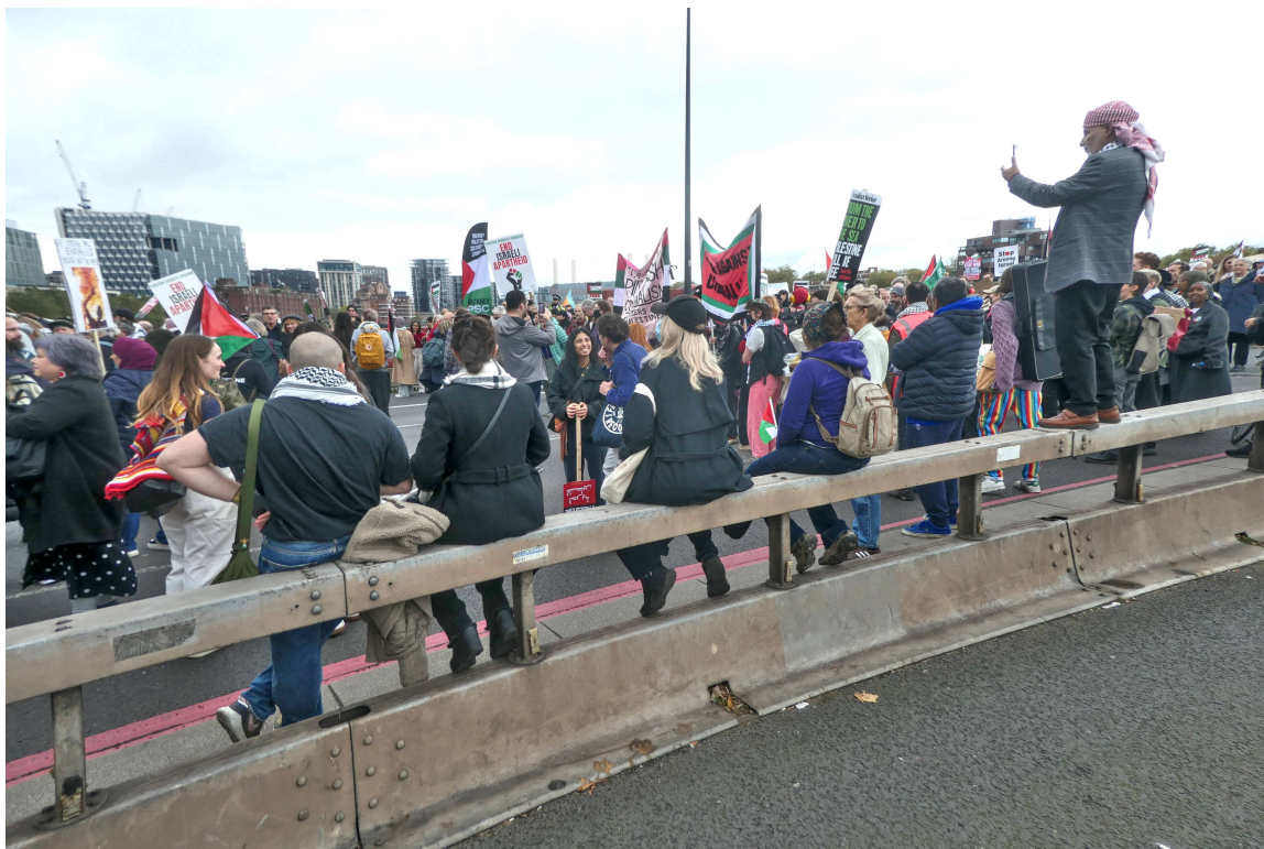
P1036455 - Capture the day.