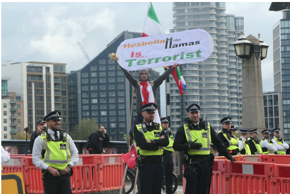
P1036433 - Counter demonstrator with a banana.