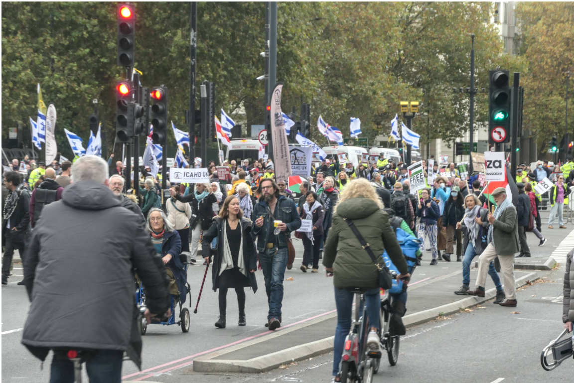
P1036449 - Stop the war.