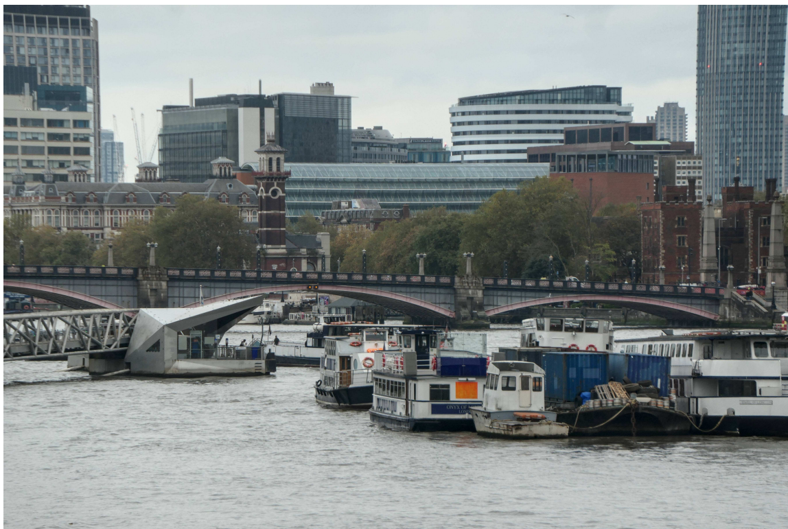
P1036452 - Lambeth Bridge