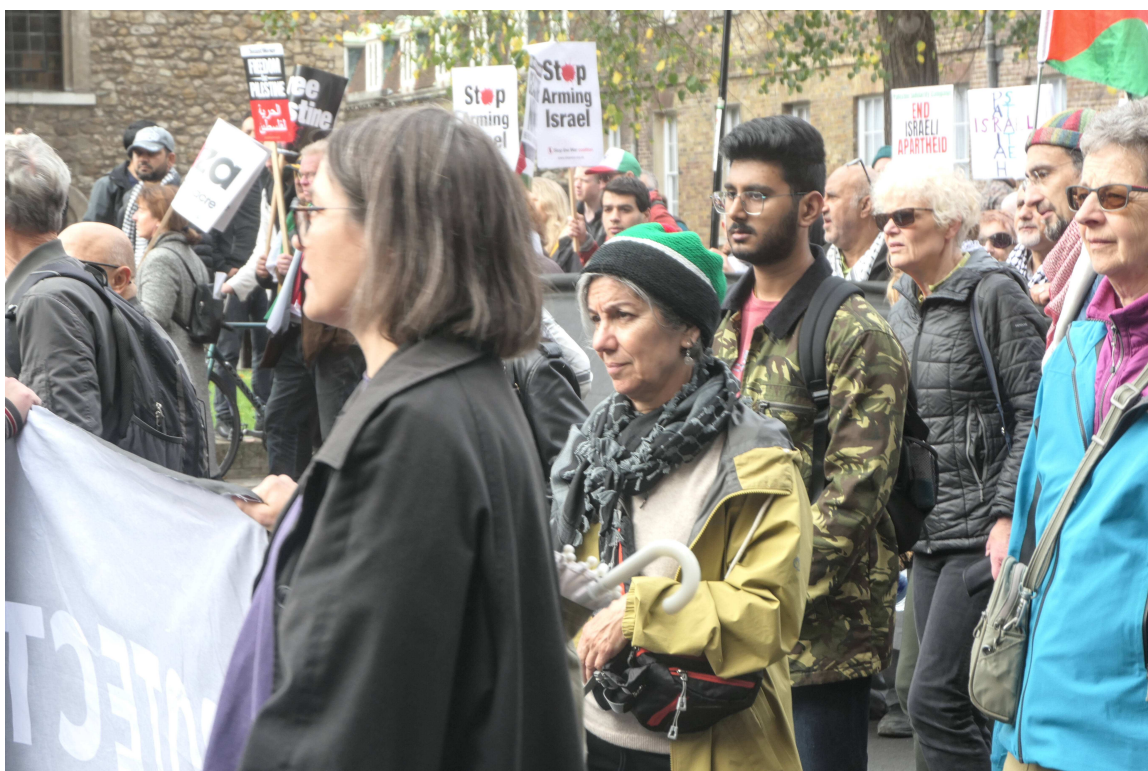
P1036428 - Stop the war.