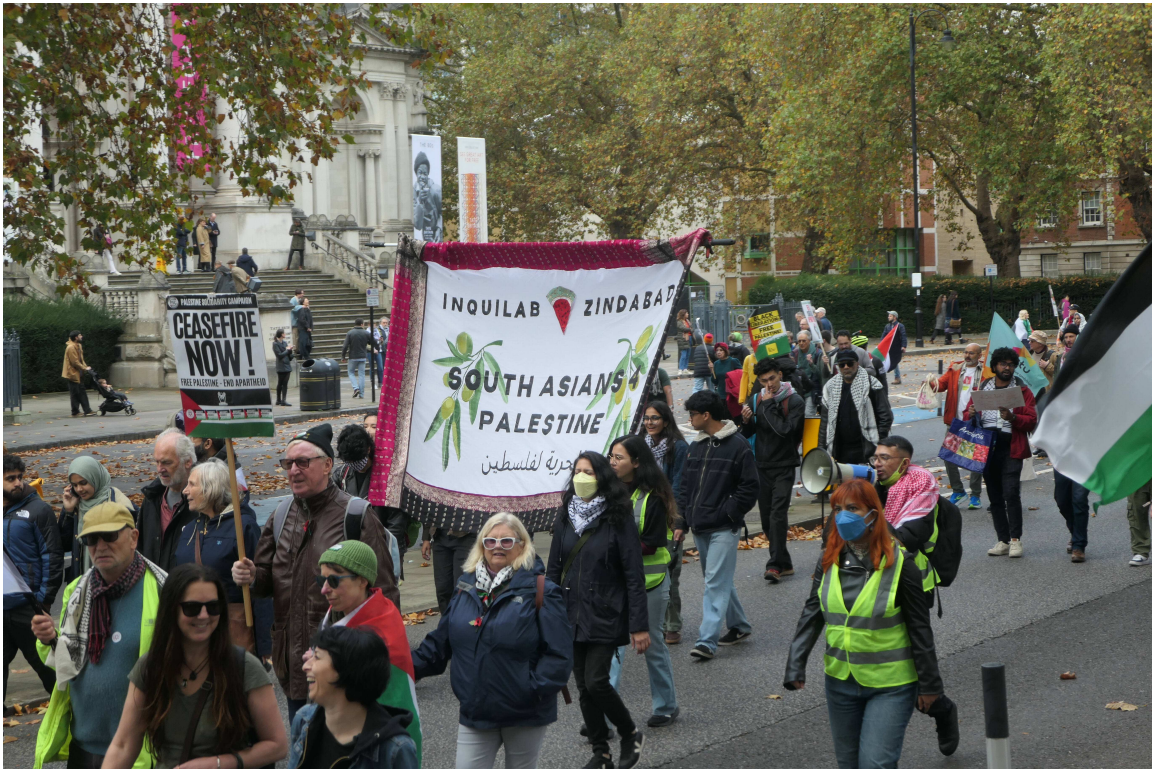
P1036441 - Stop the war.