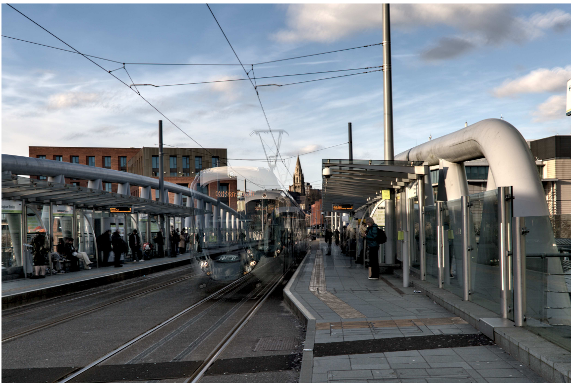
F47B0523-hdr - Ghost train.