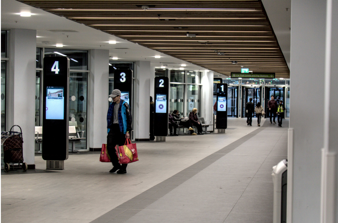
F47B0615 - Going home.