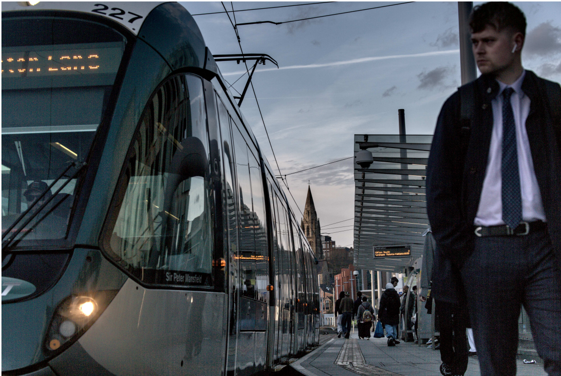
F47B0607 - Leaving the station.