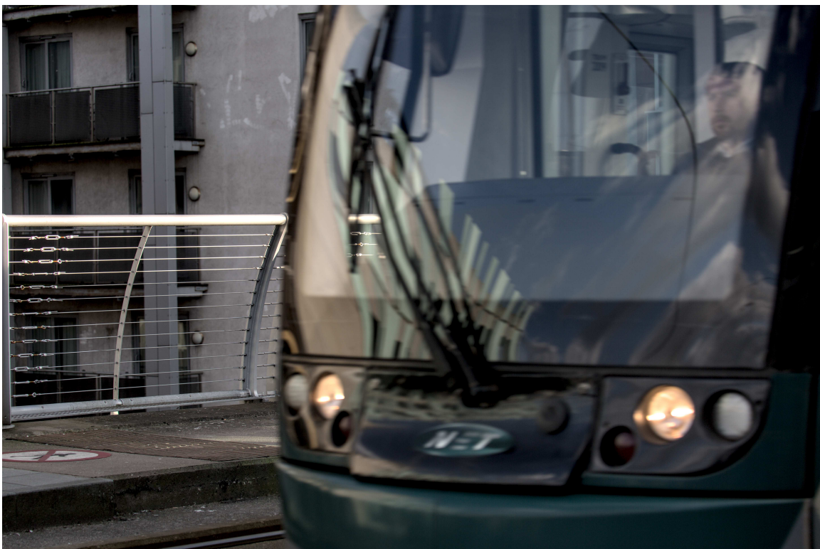
F47B0495 - Tram arrival.