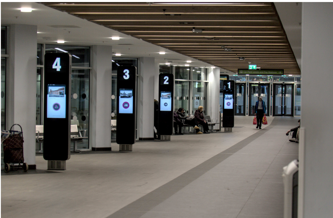
F47B0614 - Endless wait.