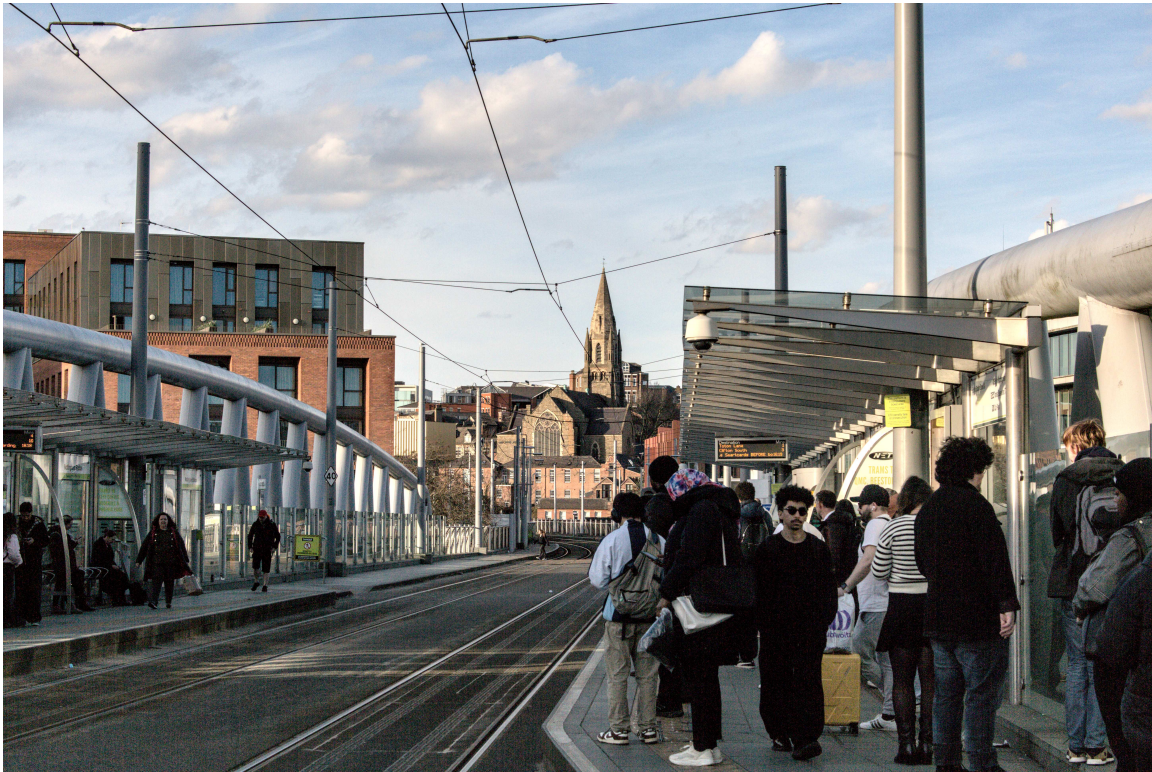
F47B0505 - Passengers on a tram platform