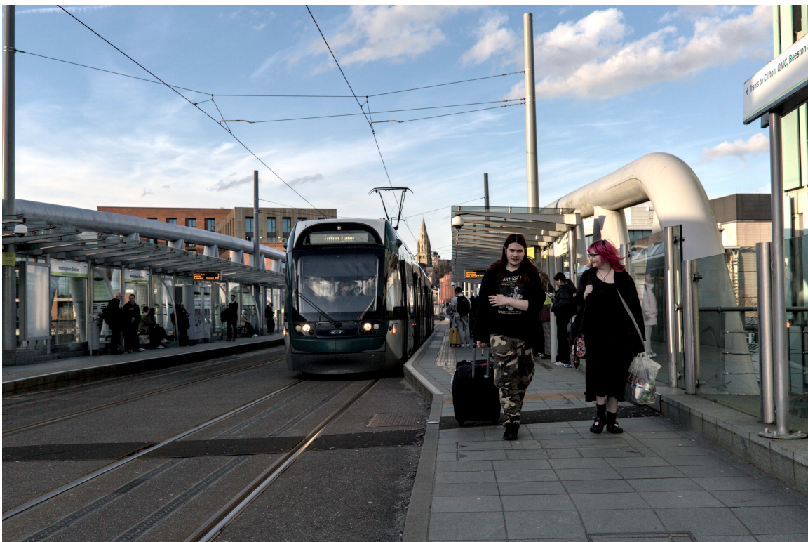
F47B0541 - Leaving the tram.