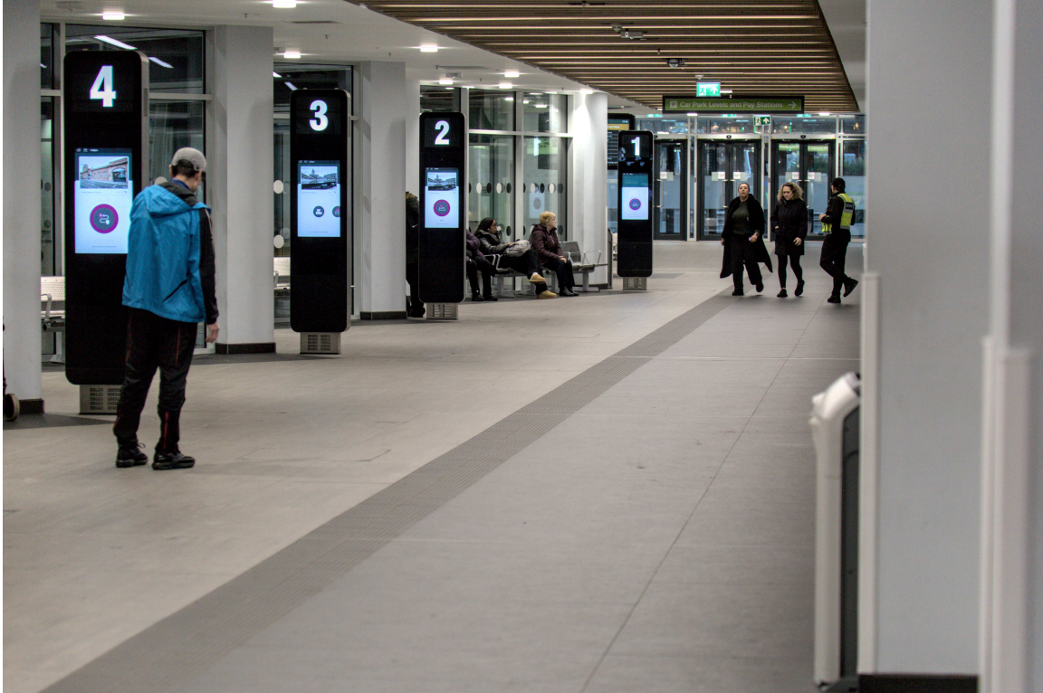
F47B0618 - Coming to go.