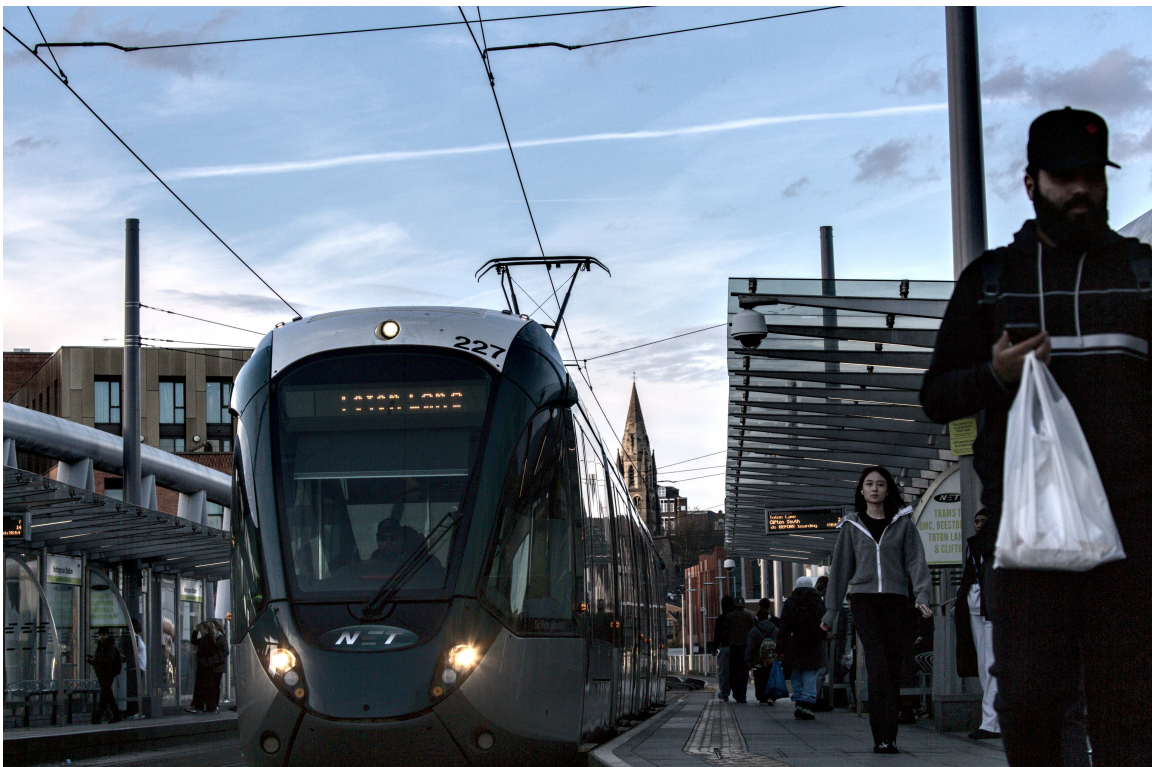
F47B0606 - Leaving the station.