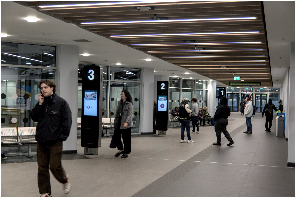
F47B0623 - Burst of activity.