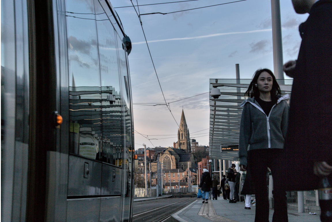
F47B0609 - Seeing double.