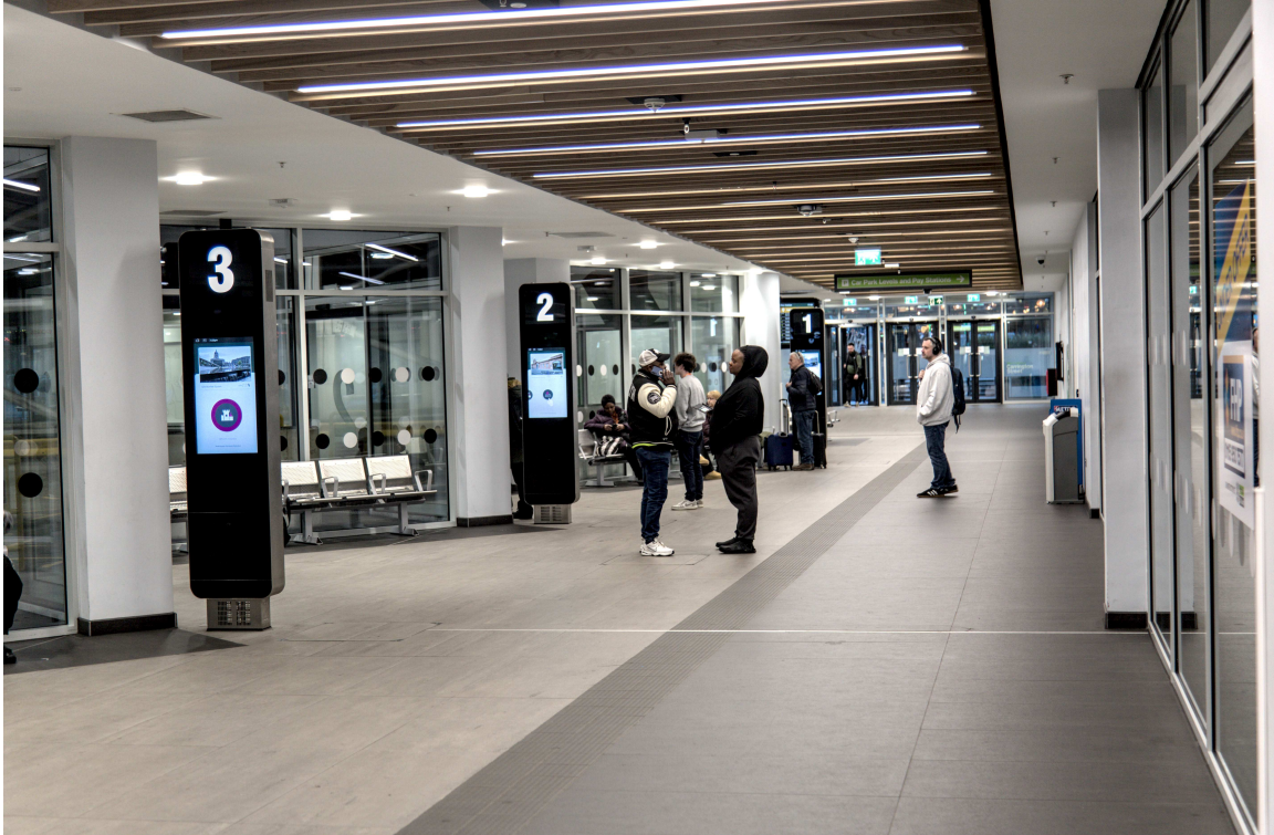
F47B0624 - We're at the bus station.