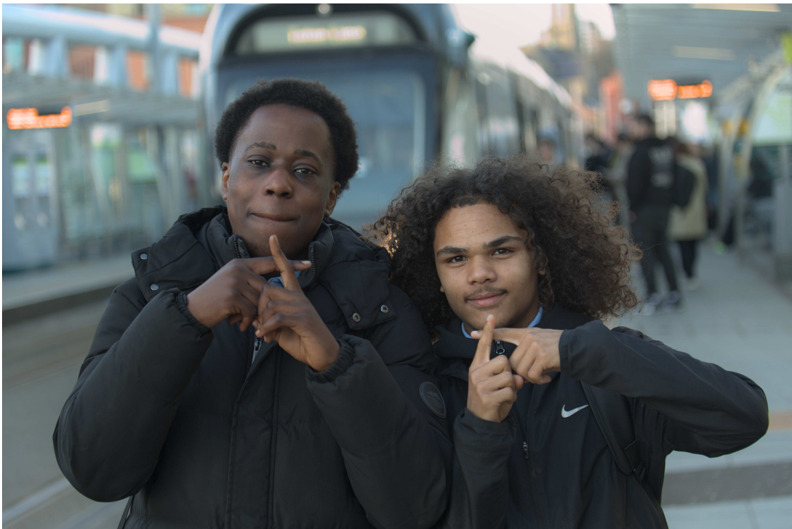
F47B0590 - Respect?