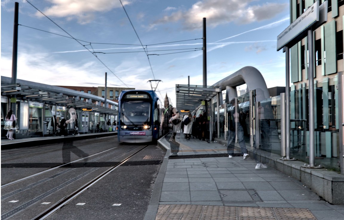
F47B0582-hdr - Crossing at speed.