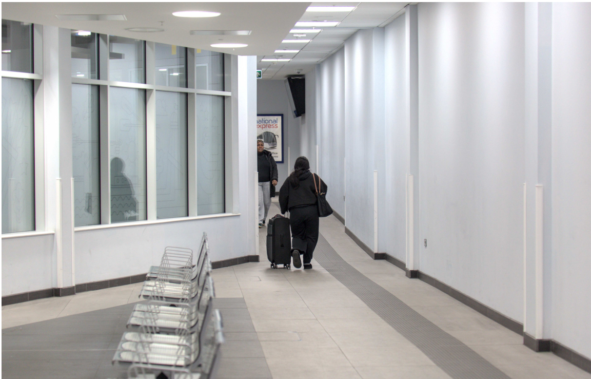
F47B0634 - Way out?