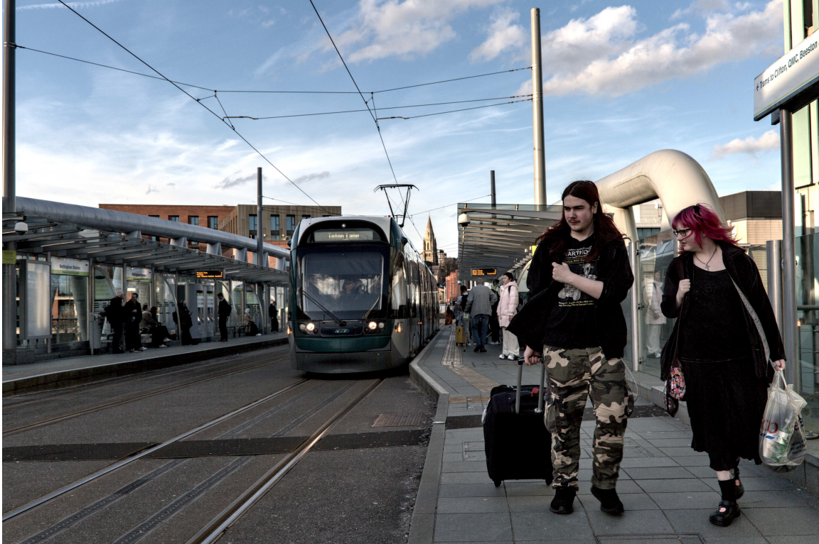
F47B0542 - Leaving the tram.