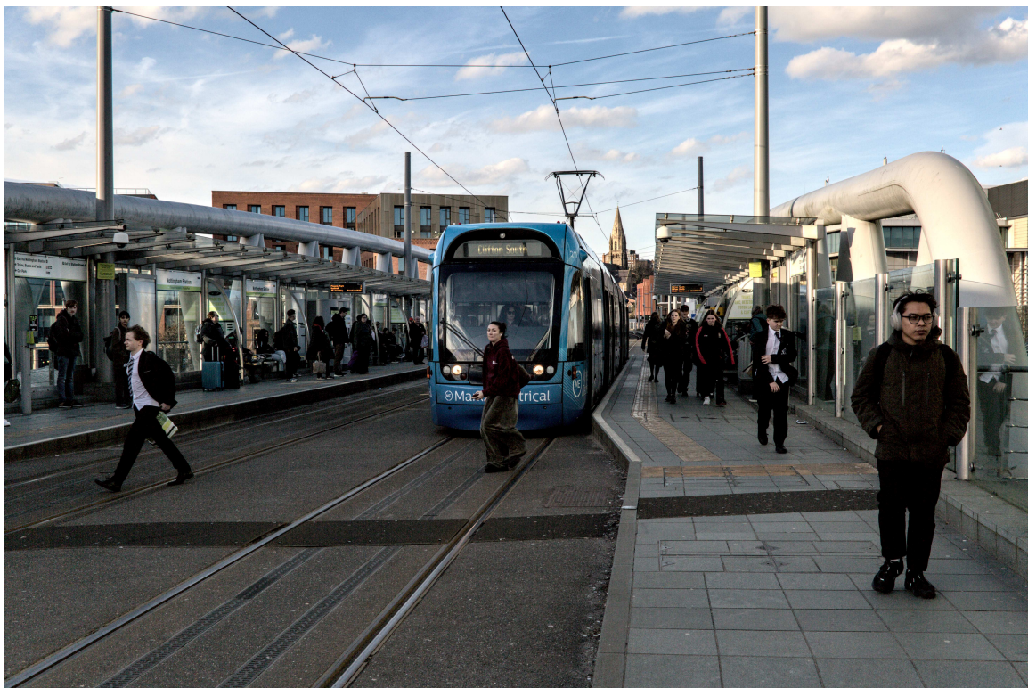
F47B0518 - Crossing the track.