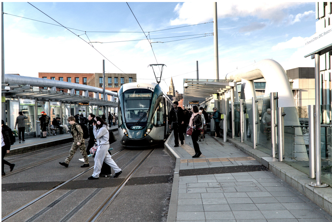
F47B0532 - Crossing the track.