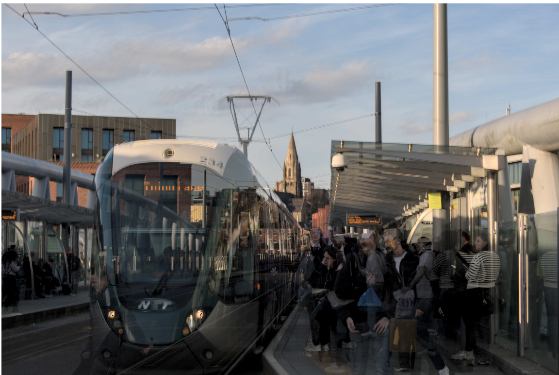
F47B0507-hdr - Embarkation at a tram station.