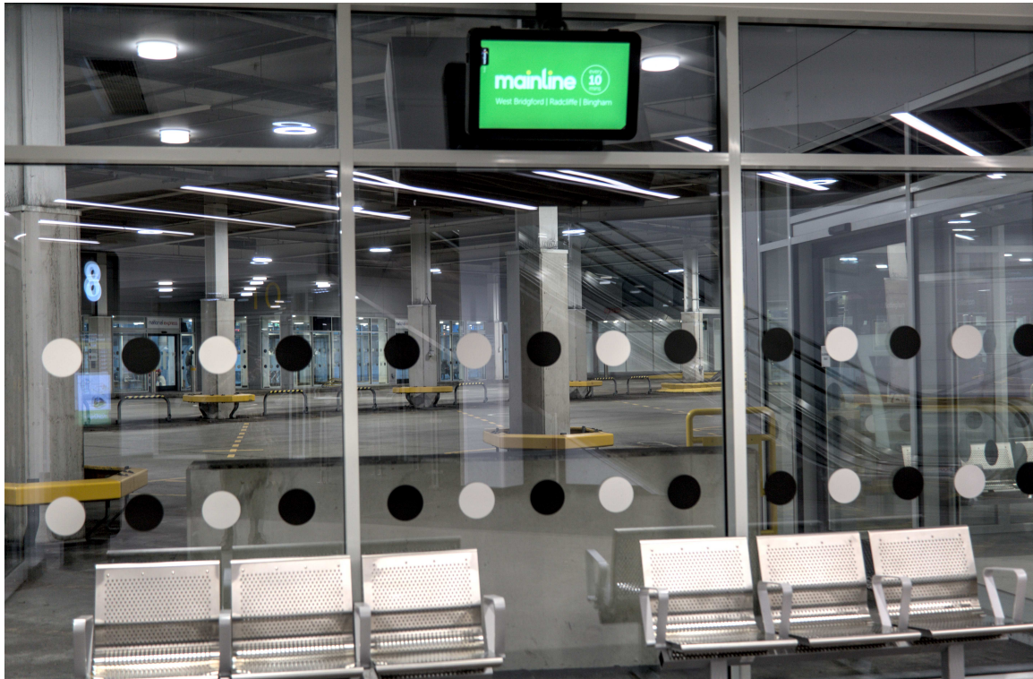
F47B0622 - No buses at all.