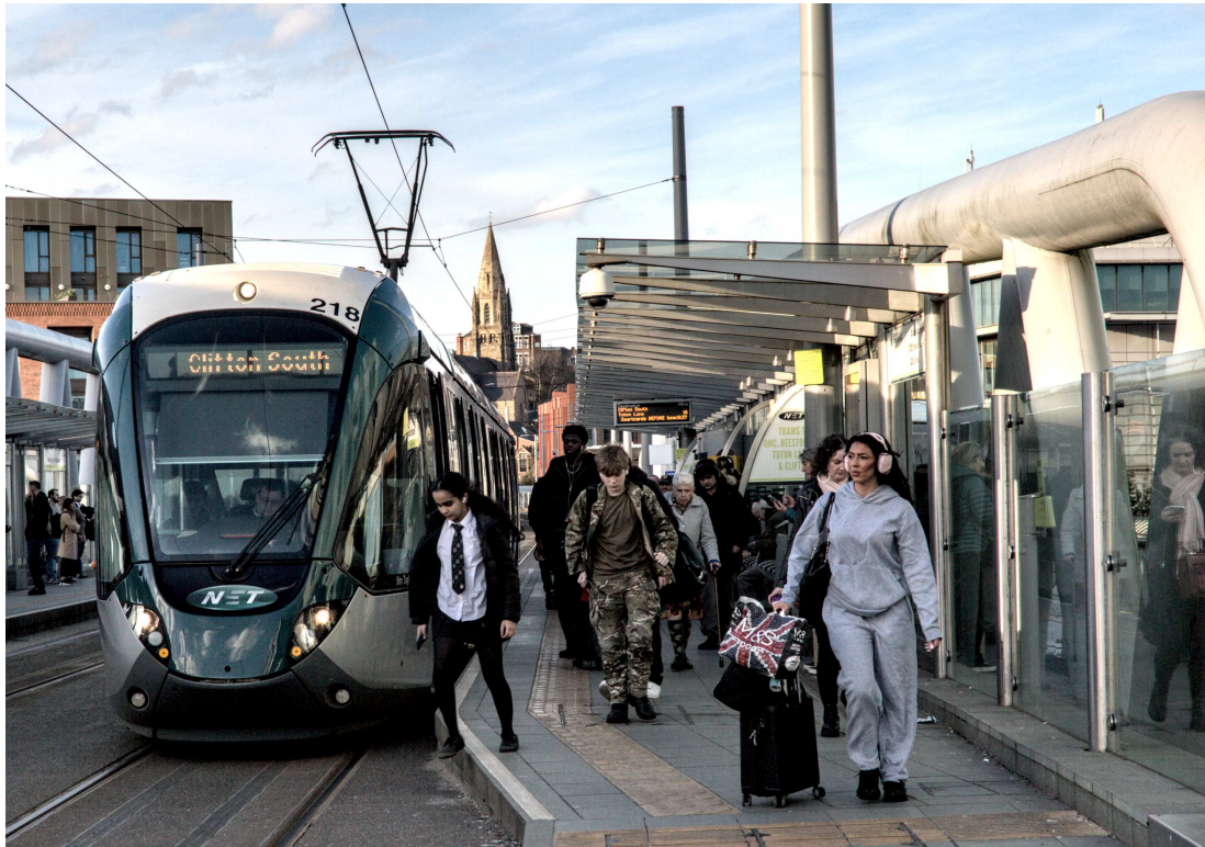
F47B0531 - Leaving the tram.