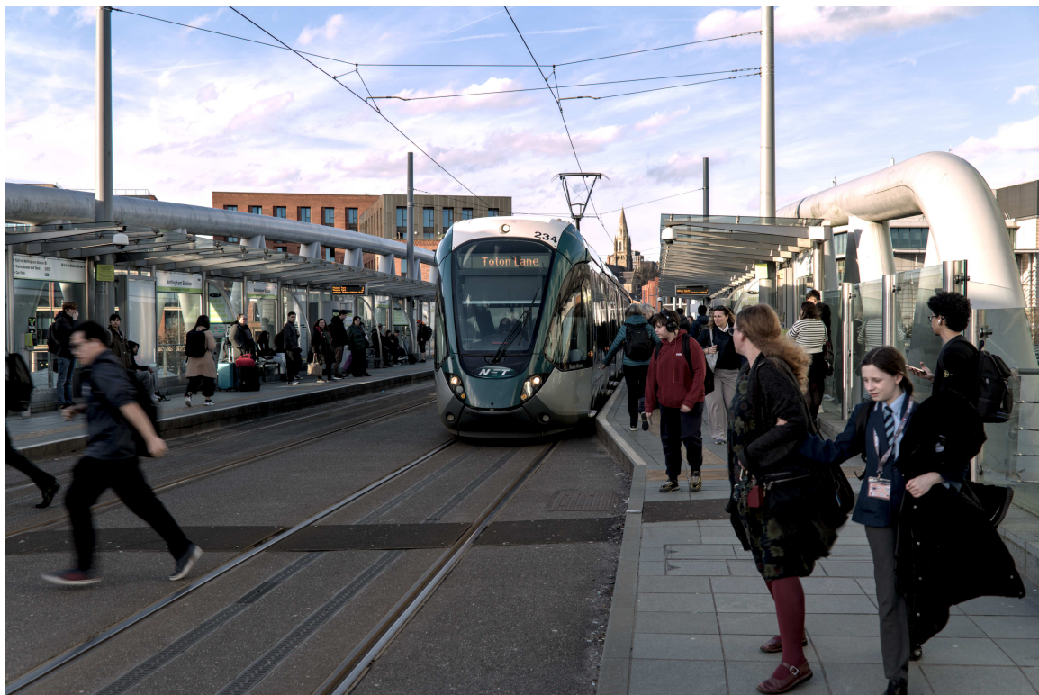
F47B0513 - Crossing the tracks.