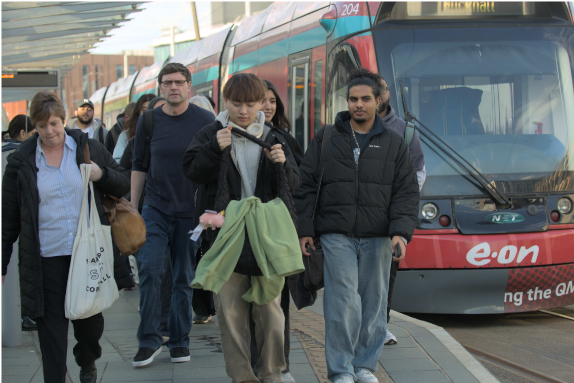
F47B0490 - Disembarkation at a tram station.