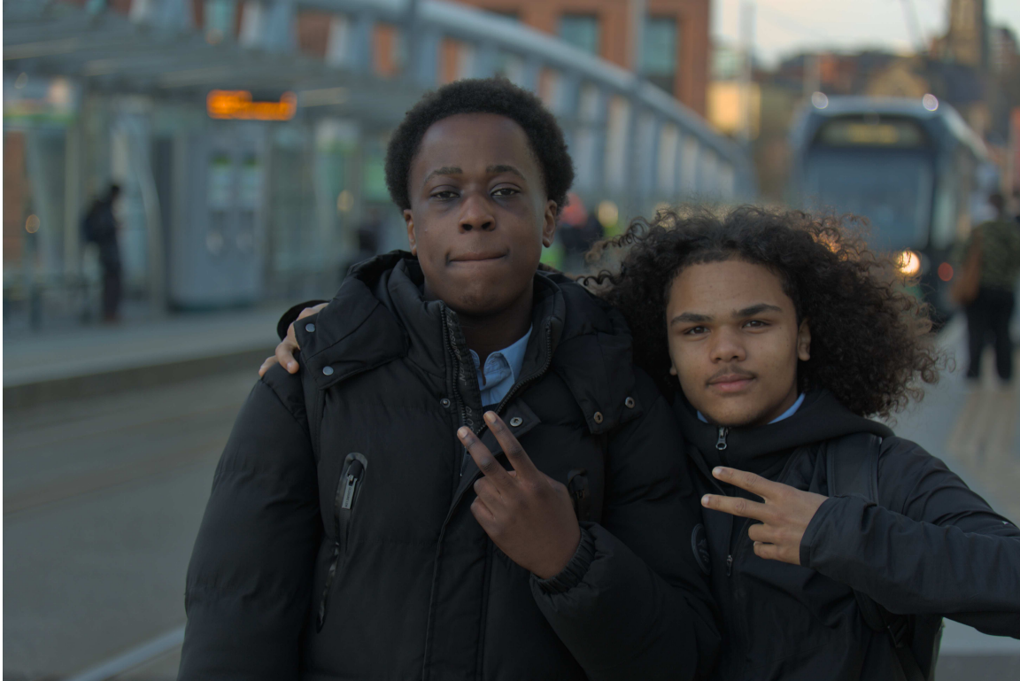
F47B0589 - Respect?