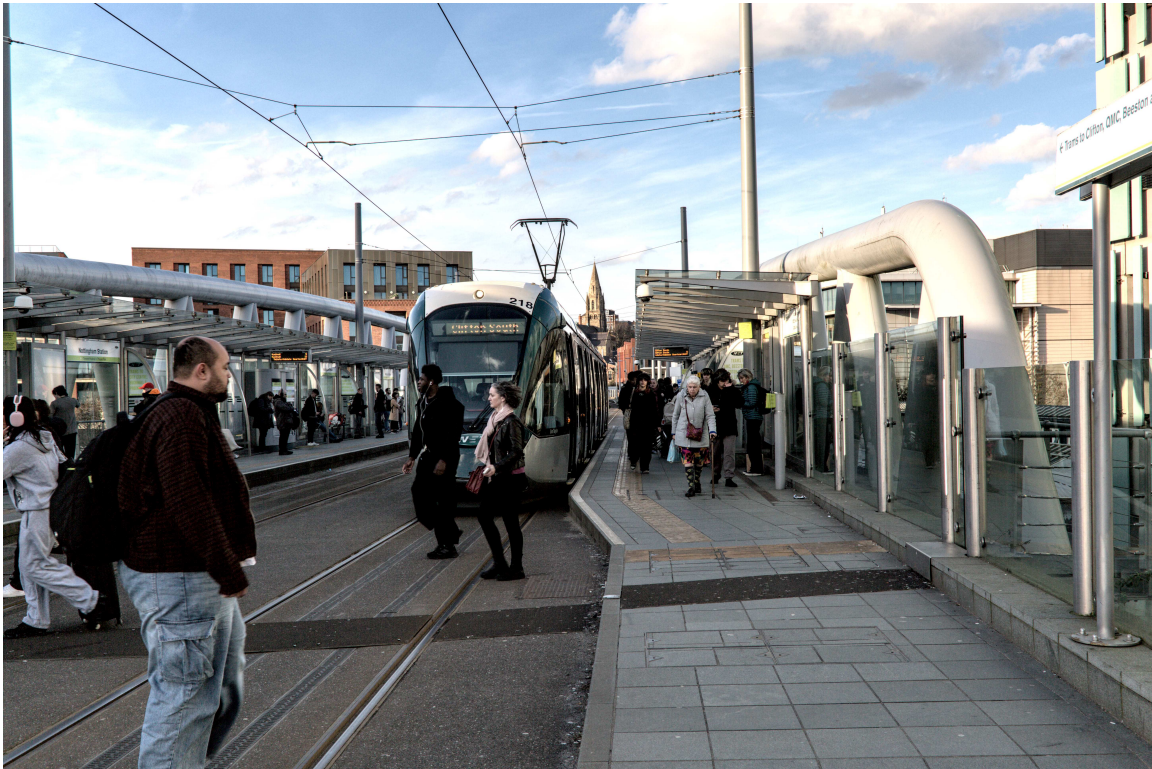
F47B0533 - Crossing the track.