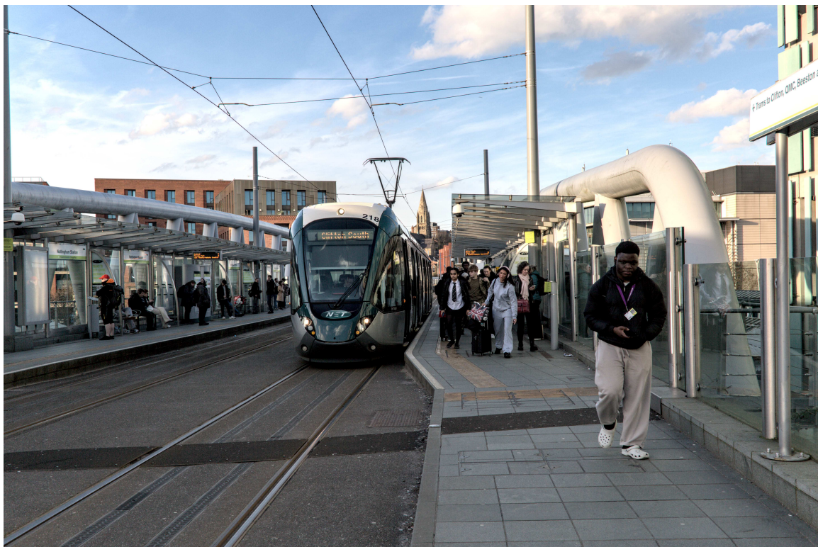
F47B0530 - Leaving the tram.