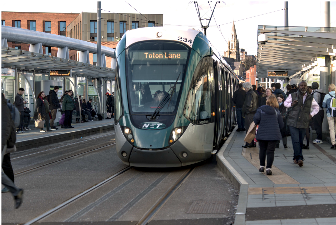
F47B0512 - Disembarking.