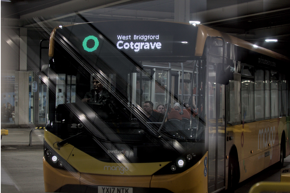
F47B0629 - The Cotgrave Flyer.