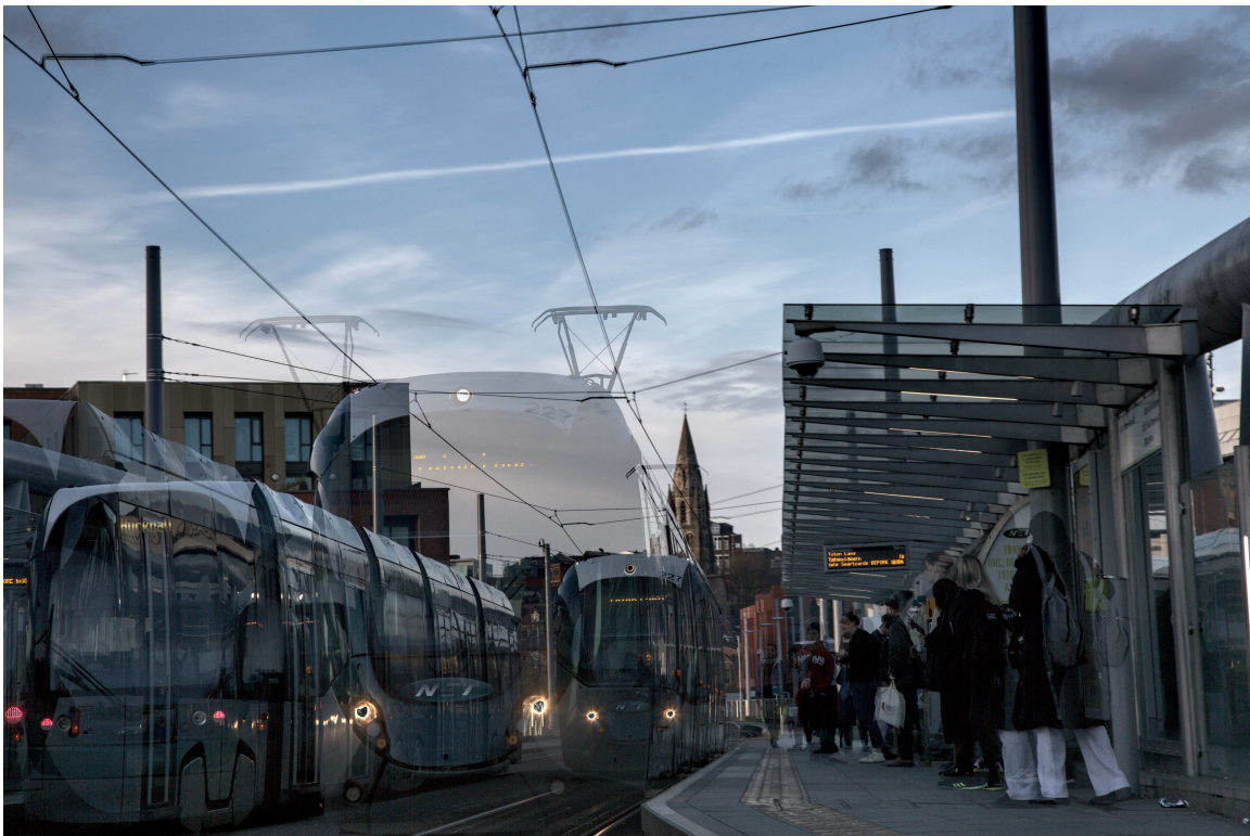
F47B0599-hdr - Trams arriving.