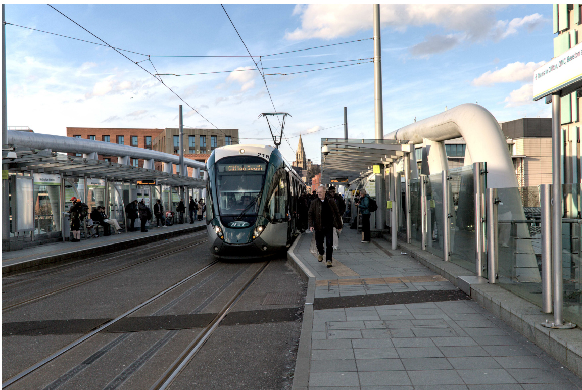
F47B0527 - Leaving the tram.