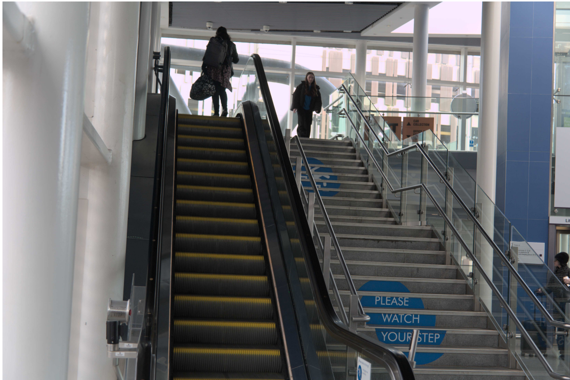
F47B0471 - Escalator