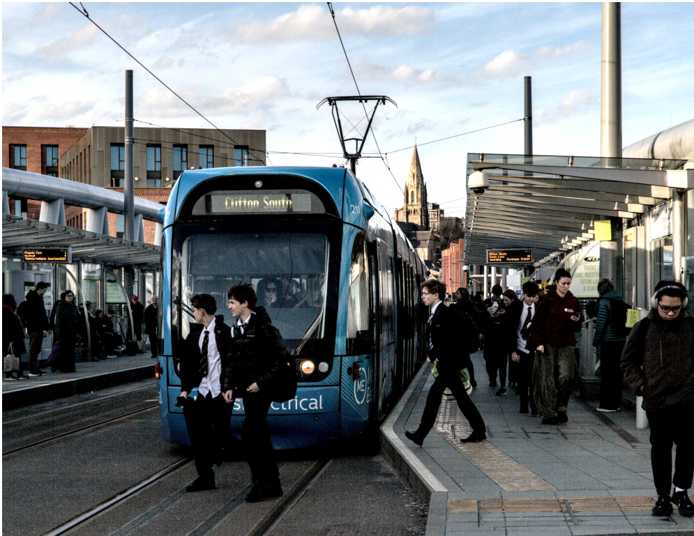
F47B0517 - Boys on the track.