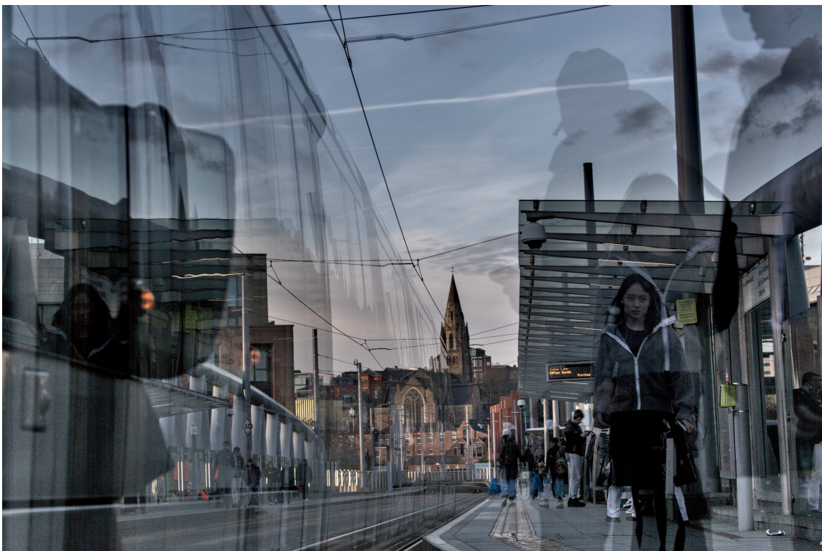
F47B0608-hdr - Visions at the station.