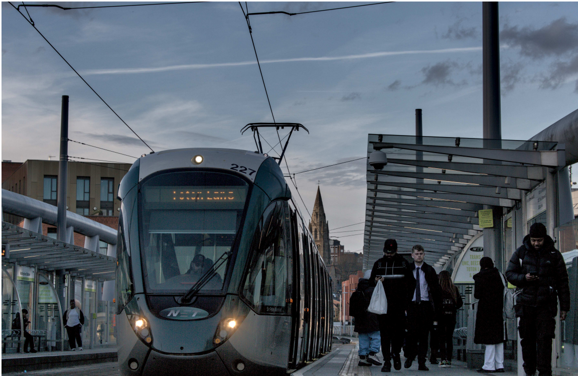
F47B0602 - Trams arriving.