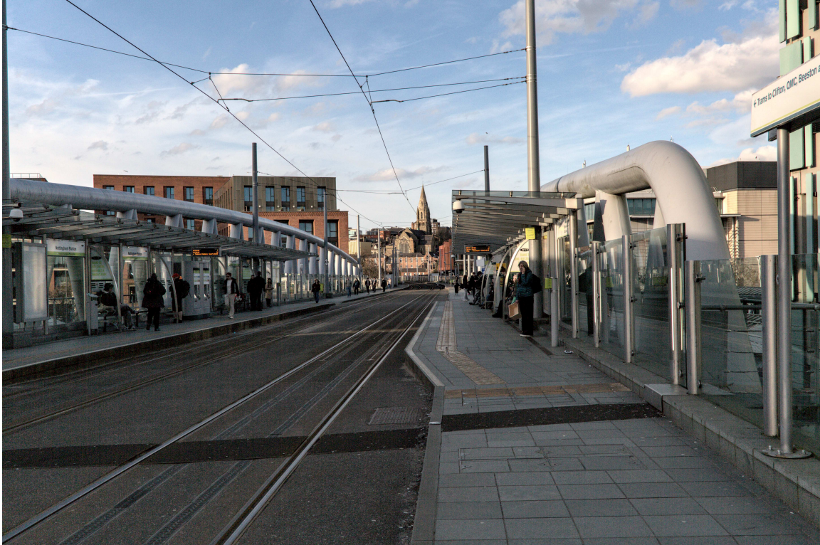
F47B0520 - Waiting for a tram.