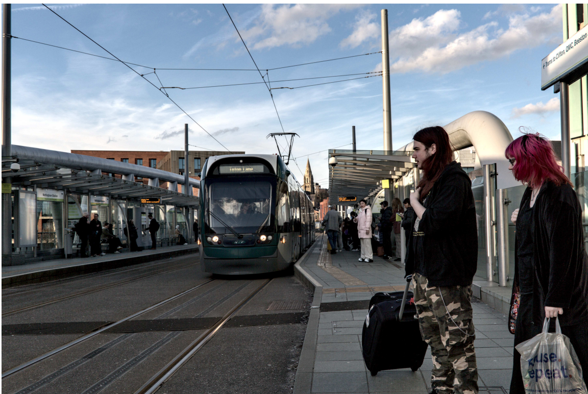
F47B0543 - Waiting to cross