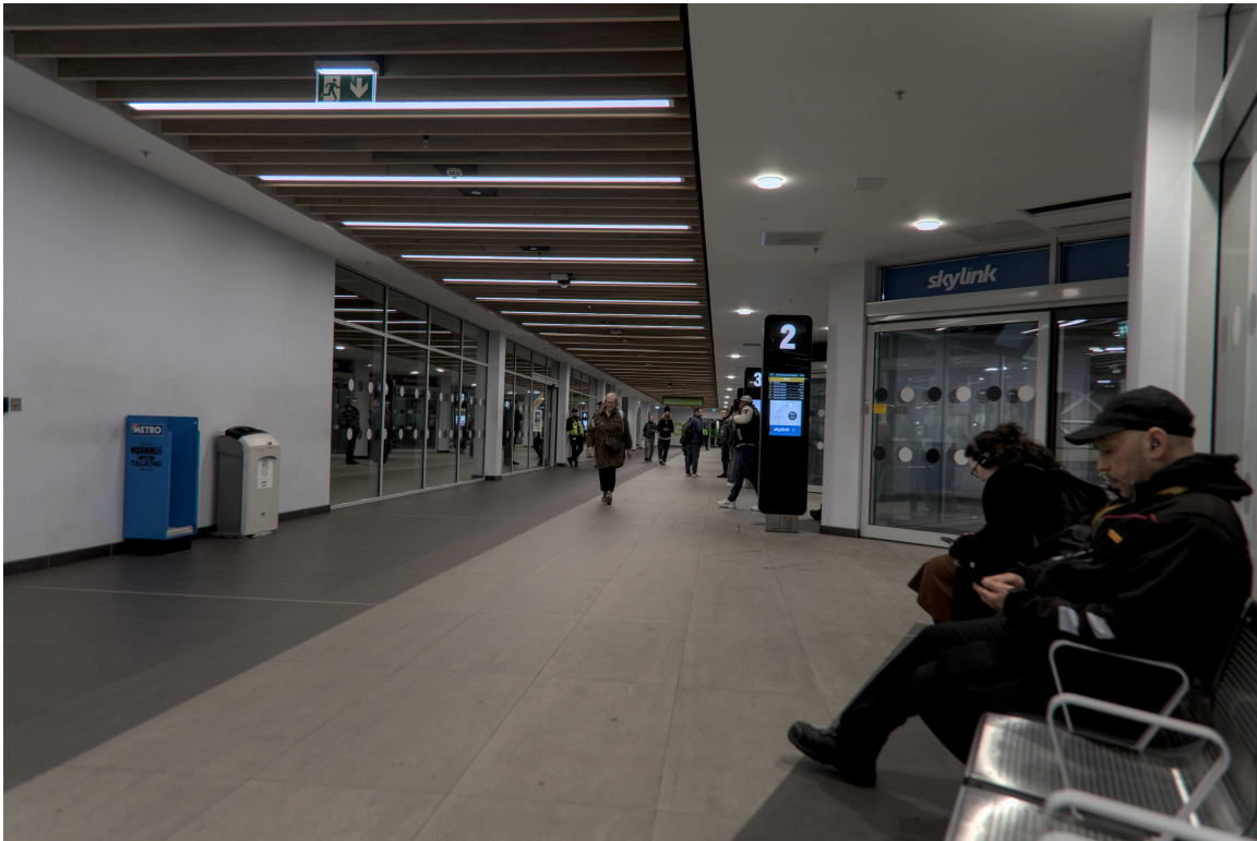
F47B0641 - Waiting for a bus.