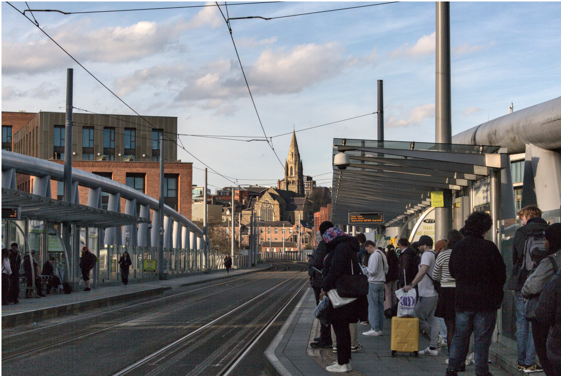
F47B0508 - Passengers at a tram station.