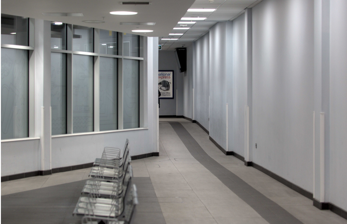
F47B0633 - Way out?