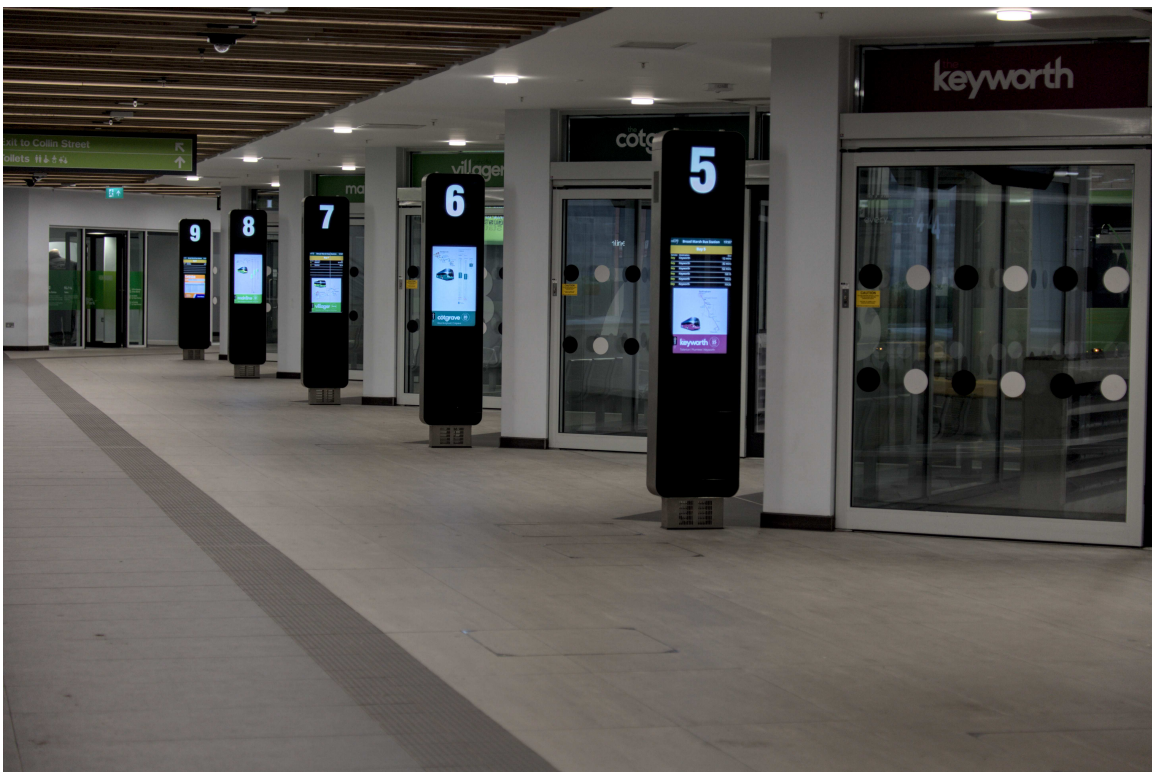
F47B0612 - Five, Six, Seven, Eight.