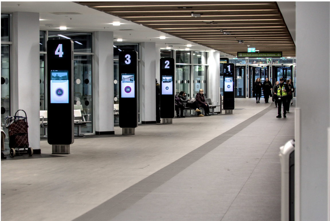
F47B0616 - Coming to go.