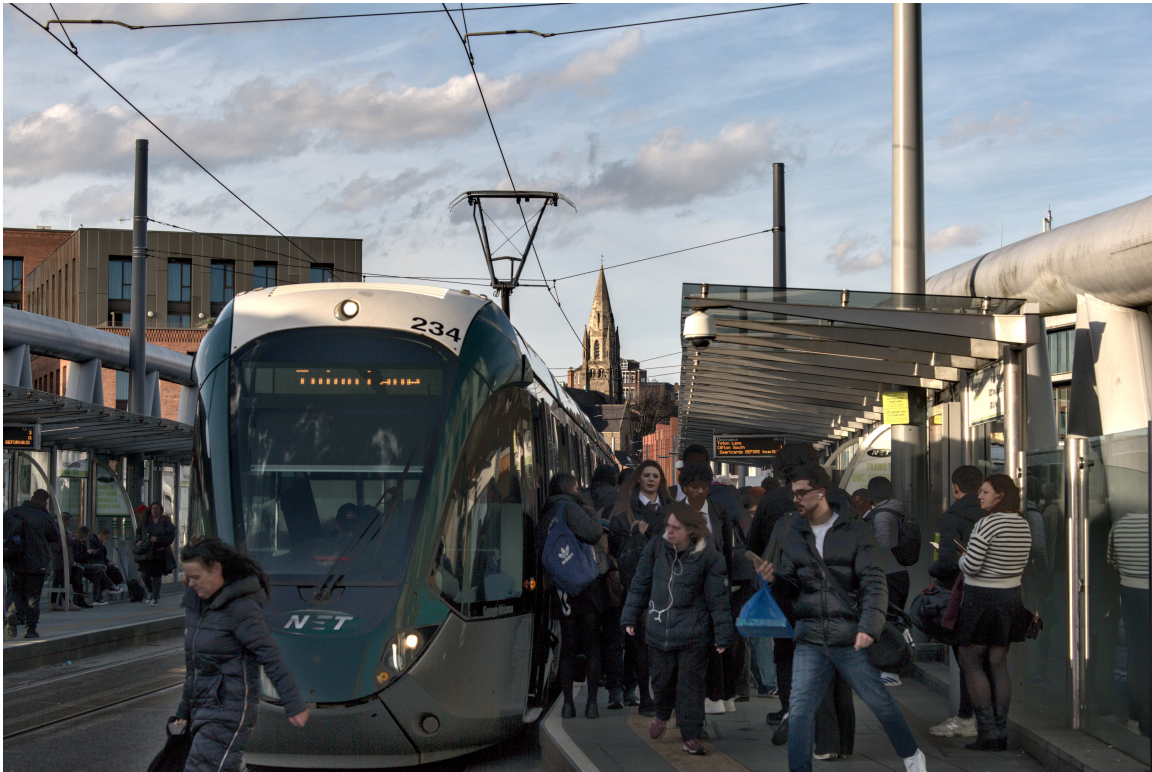
F47B0510 - Crossing the tracks.