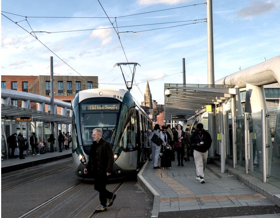
F47B0528 - Crossing the track.