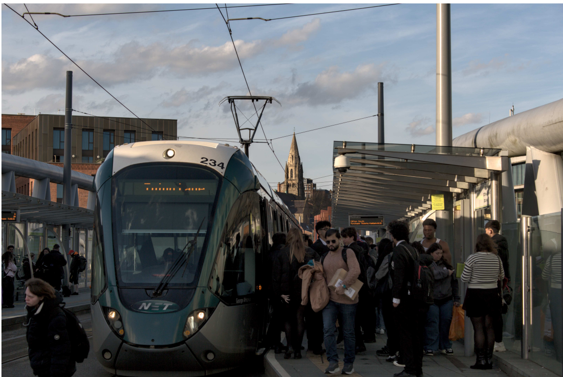
F47B0511 - Crossing the tracks.