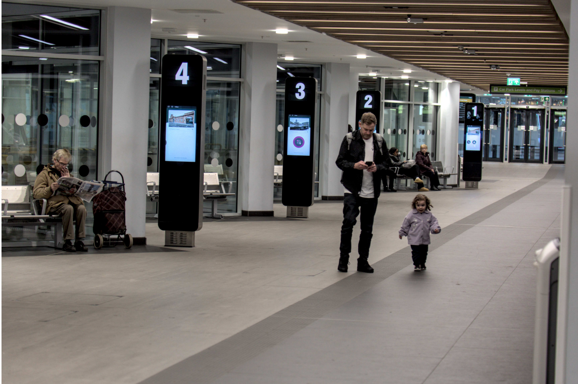
F47B0613 - Father and child.