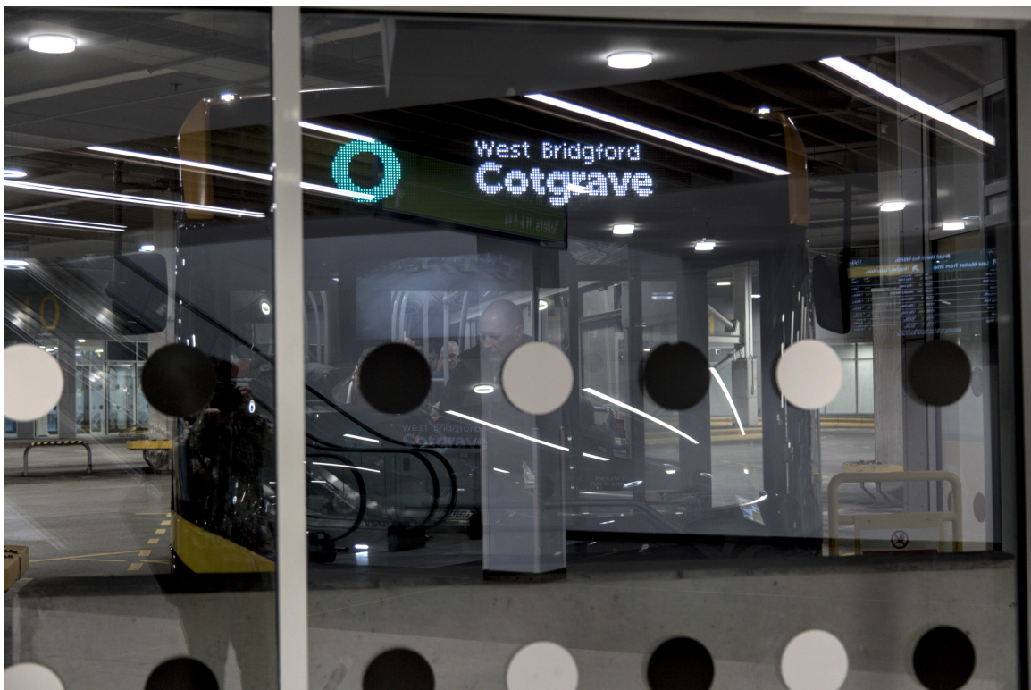
F47B0628 - The Cotgrave Flyer.