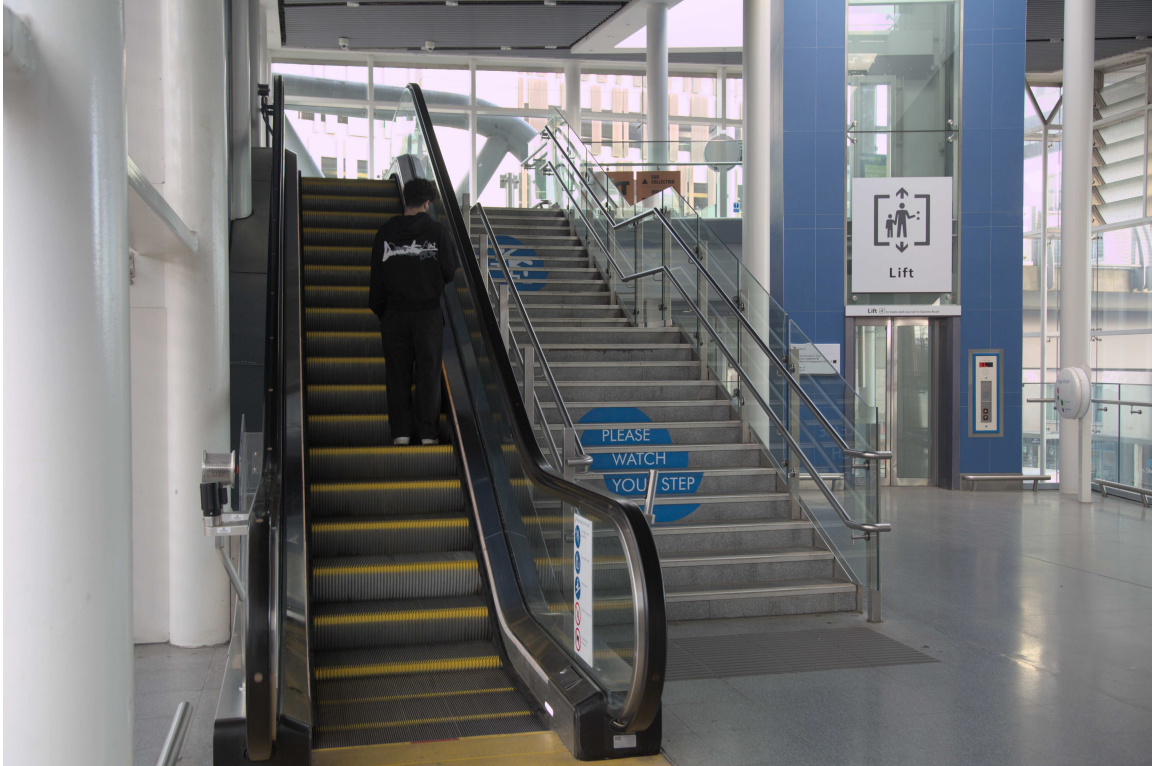
F47B0474 - Escalator