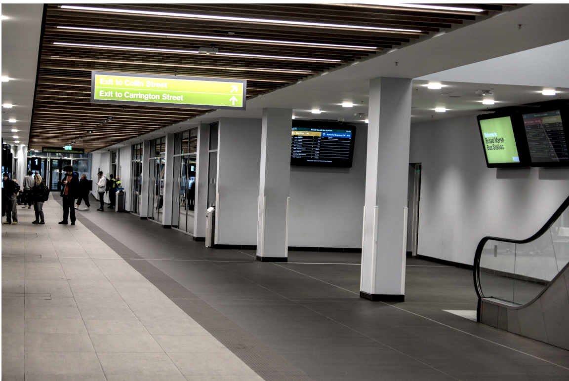
F47B0620 - Queuing to leave.