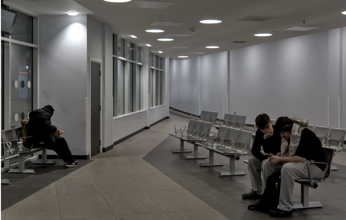
F47B0639 - Endless wait.