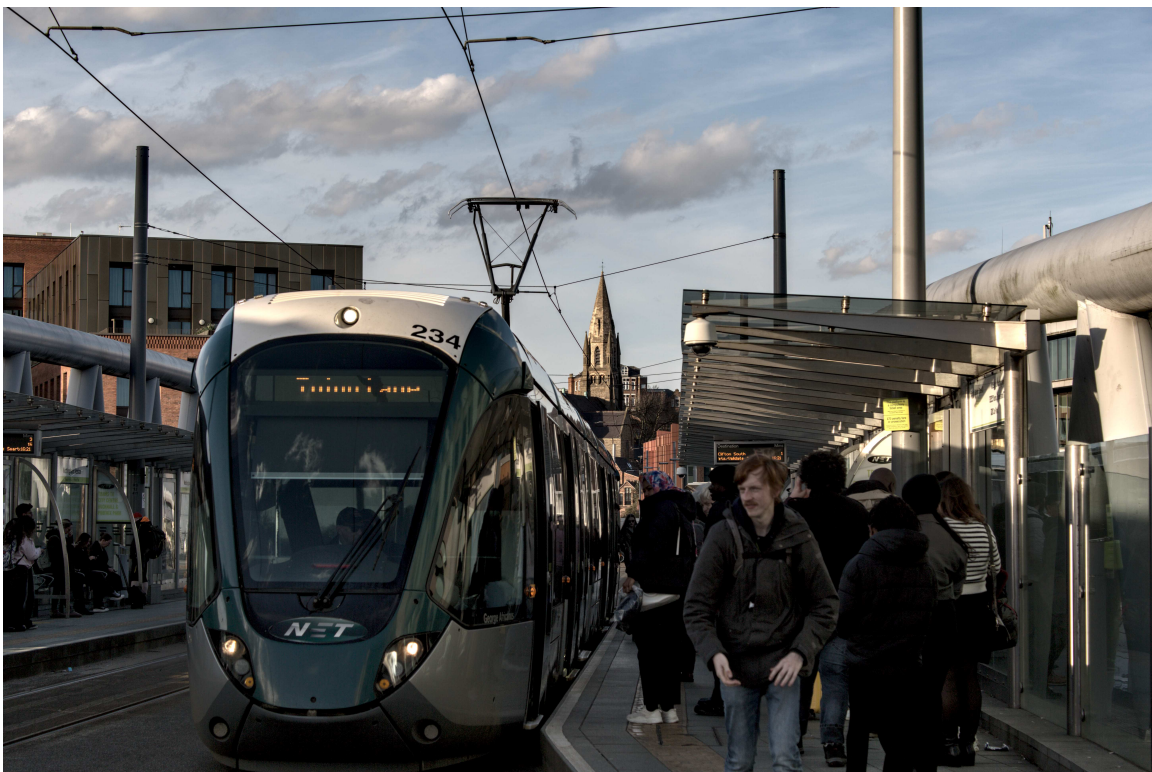
F47B0509 - Disembarkation at a tram station.