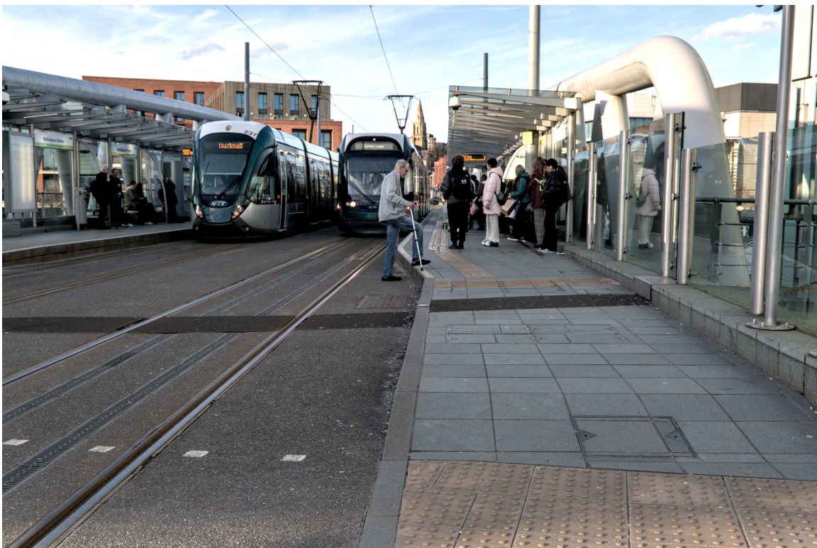
F47B0538 - Crossing the track with a walking stick.