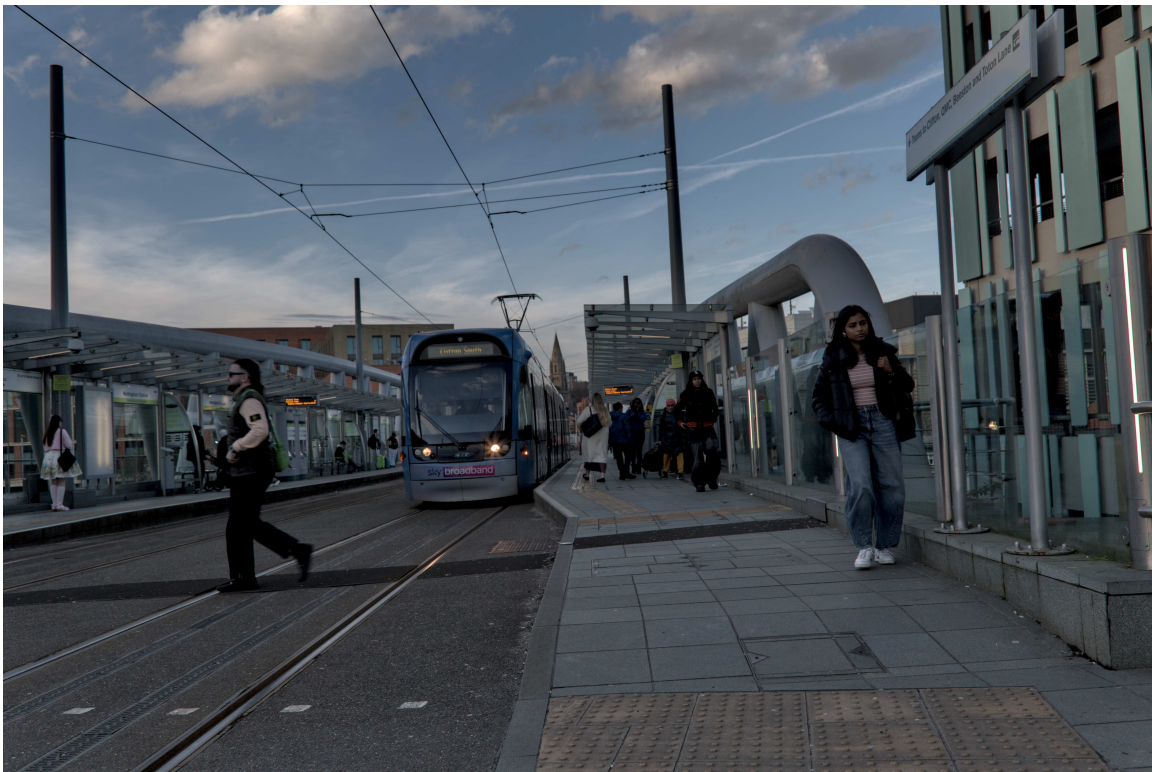
F47B0583 - Crossing the track.