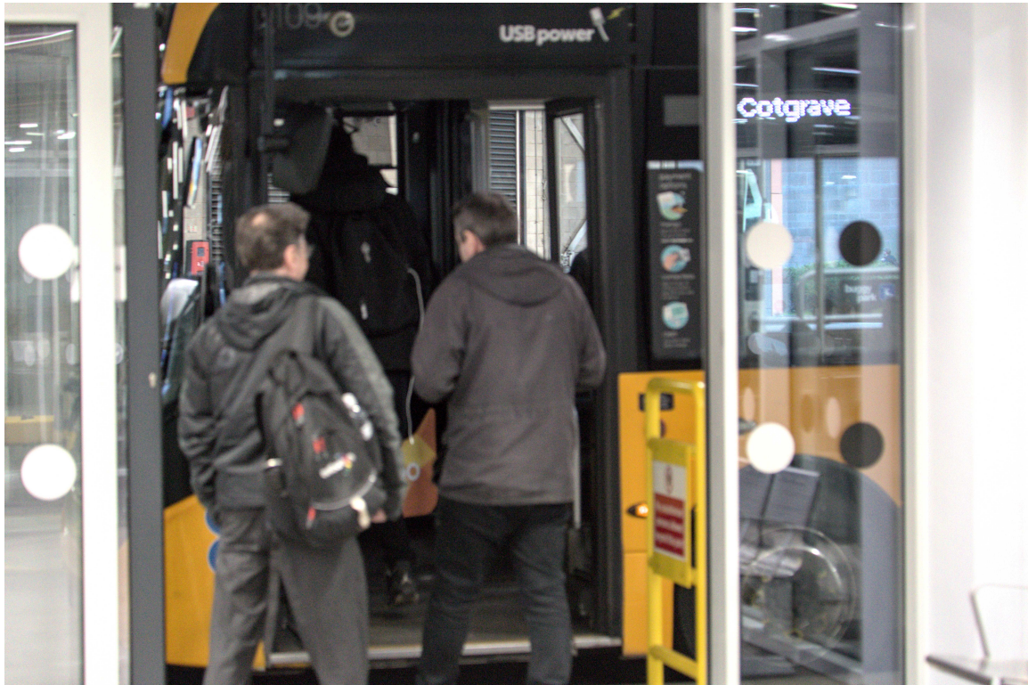
F47B0626 - Embarkation.