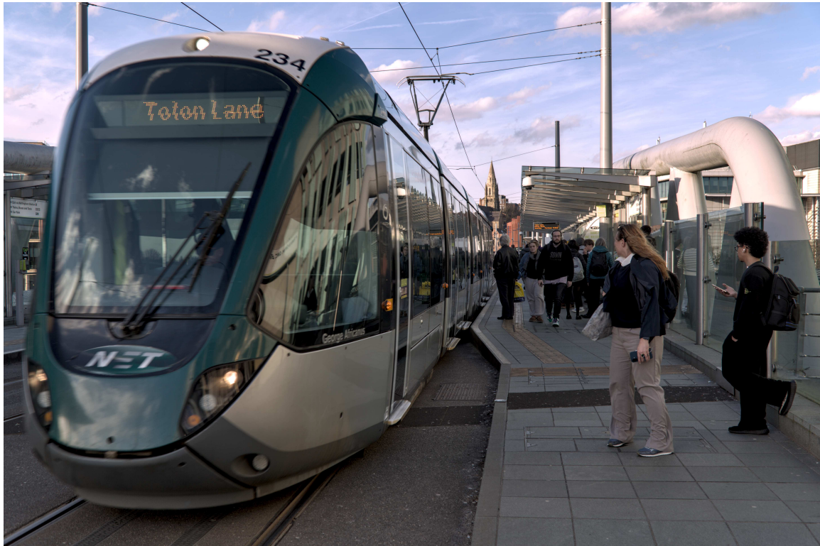
F47B0515 - Tram leaving the station.