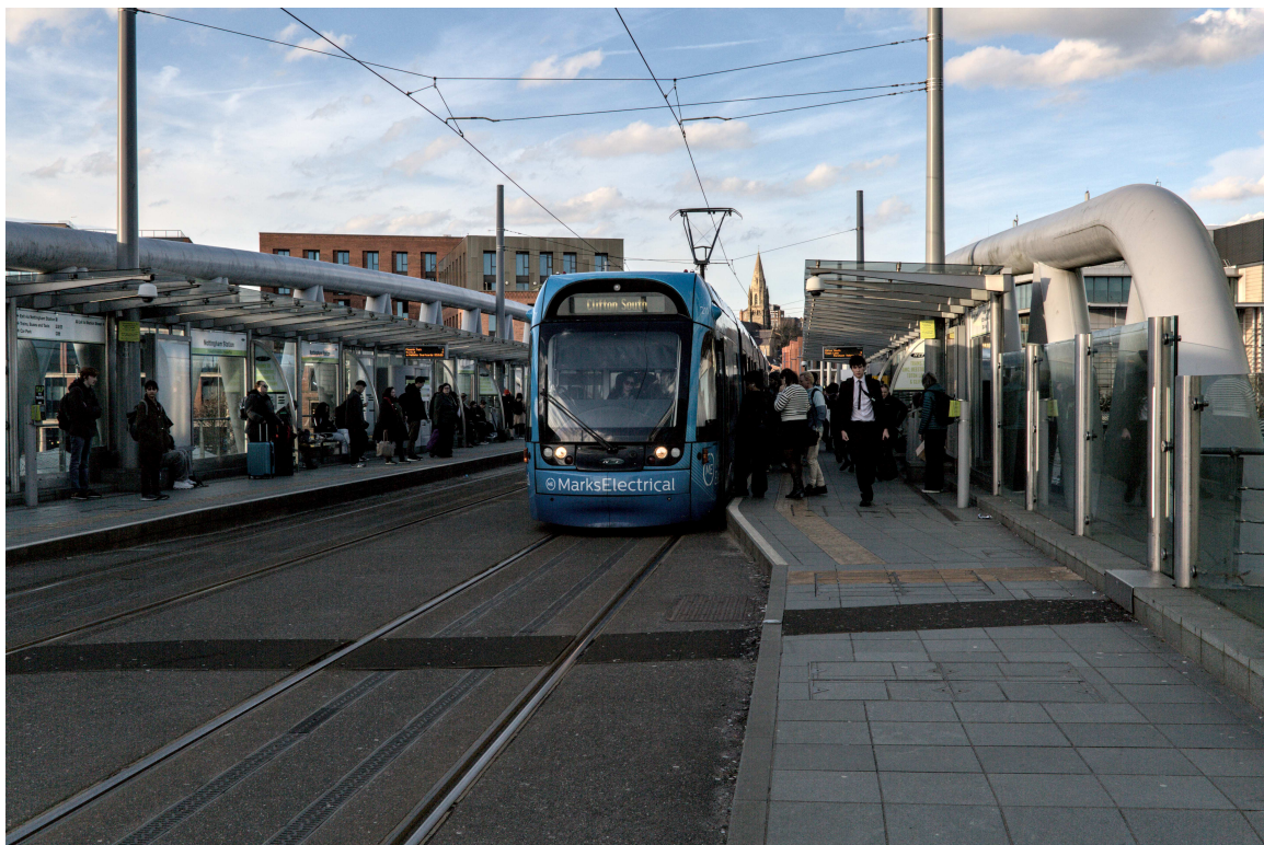
F47B0516 - Tram leaving the station.