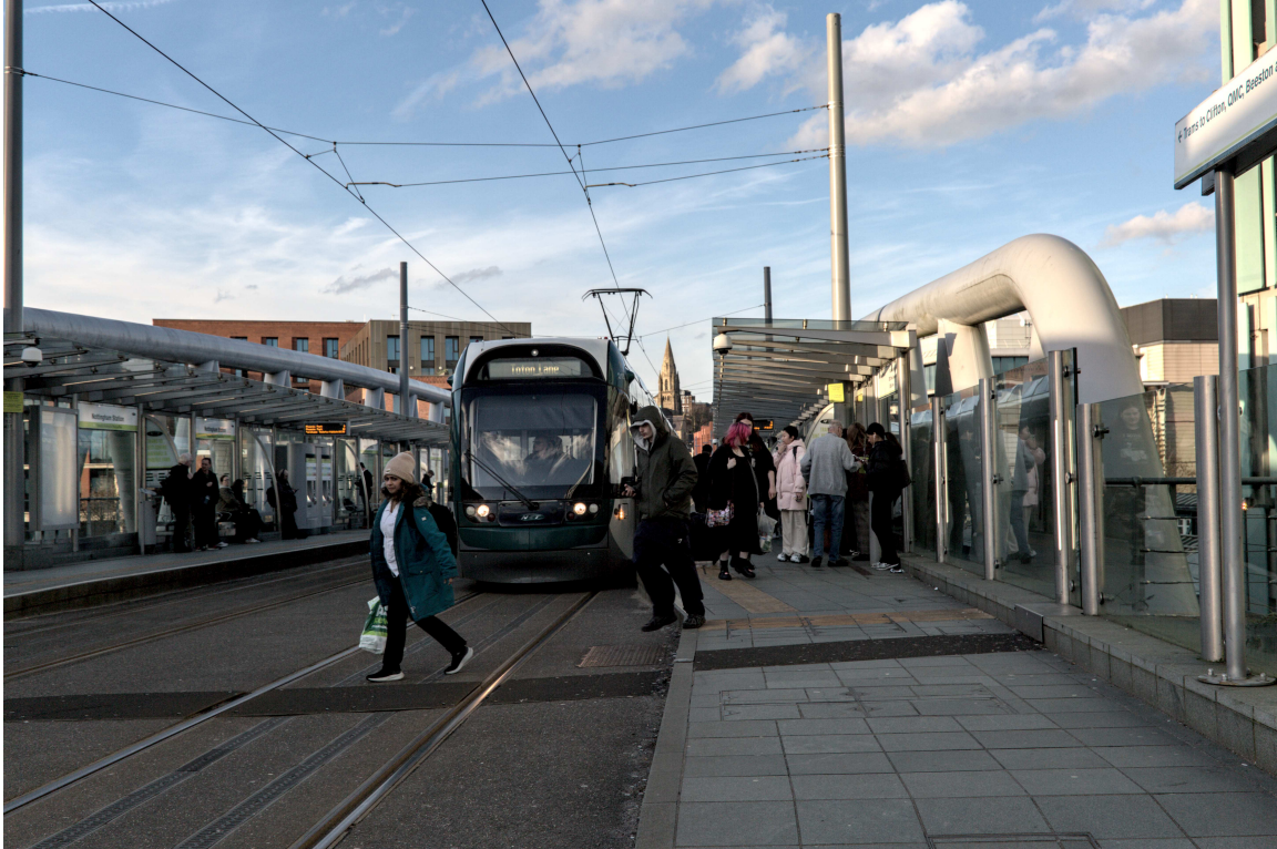
F47B0539 - Crossing the track.