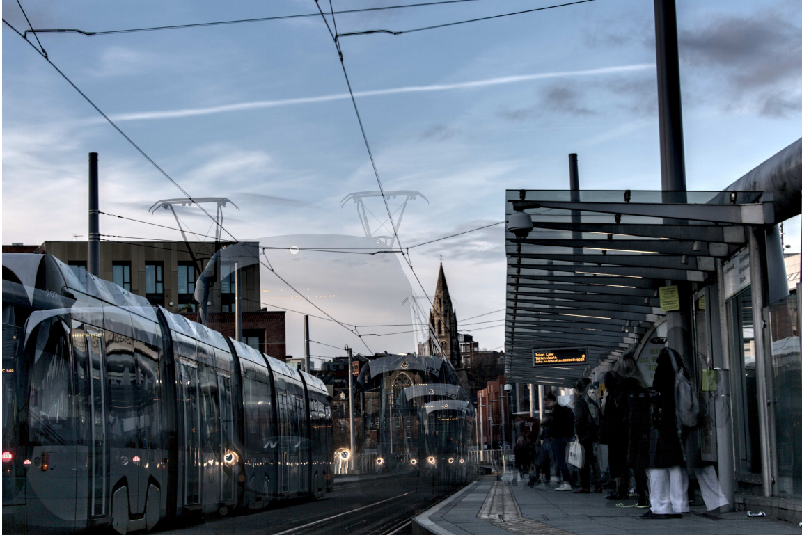
F47B0597-hdr - Multiple images.