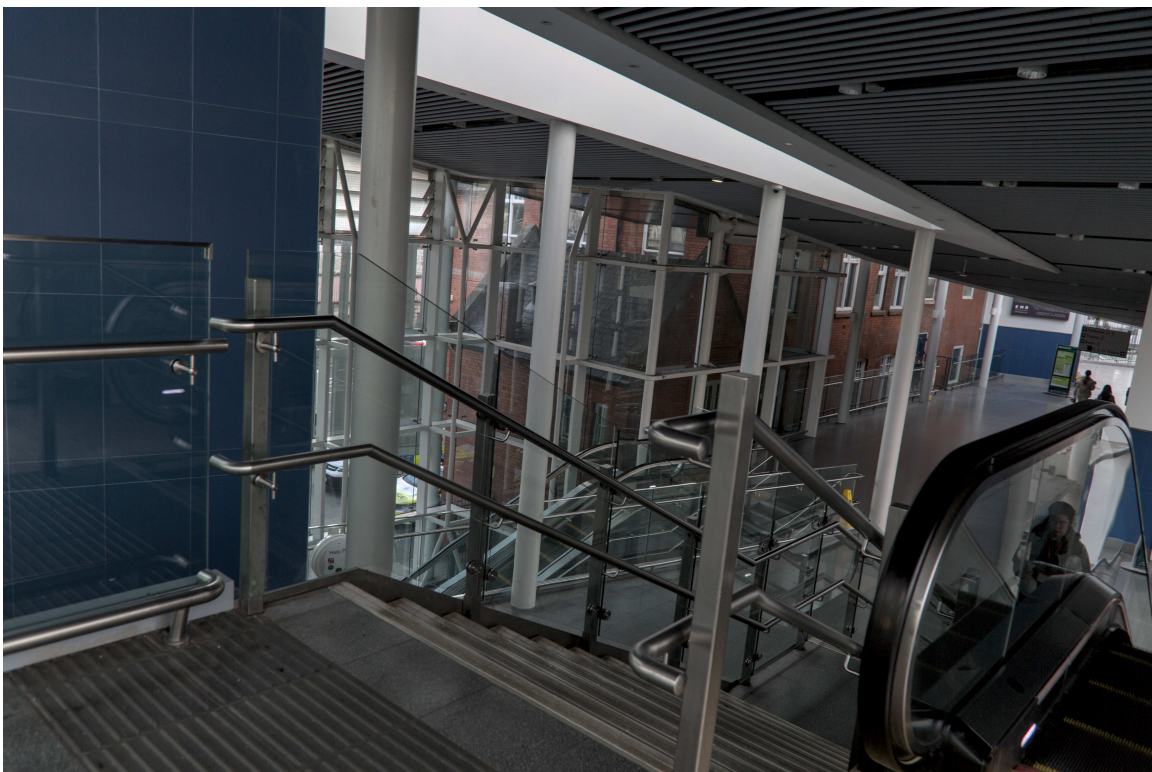
F47B0478 - Escalator