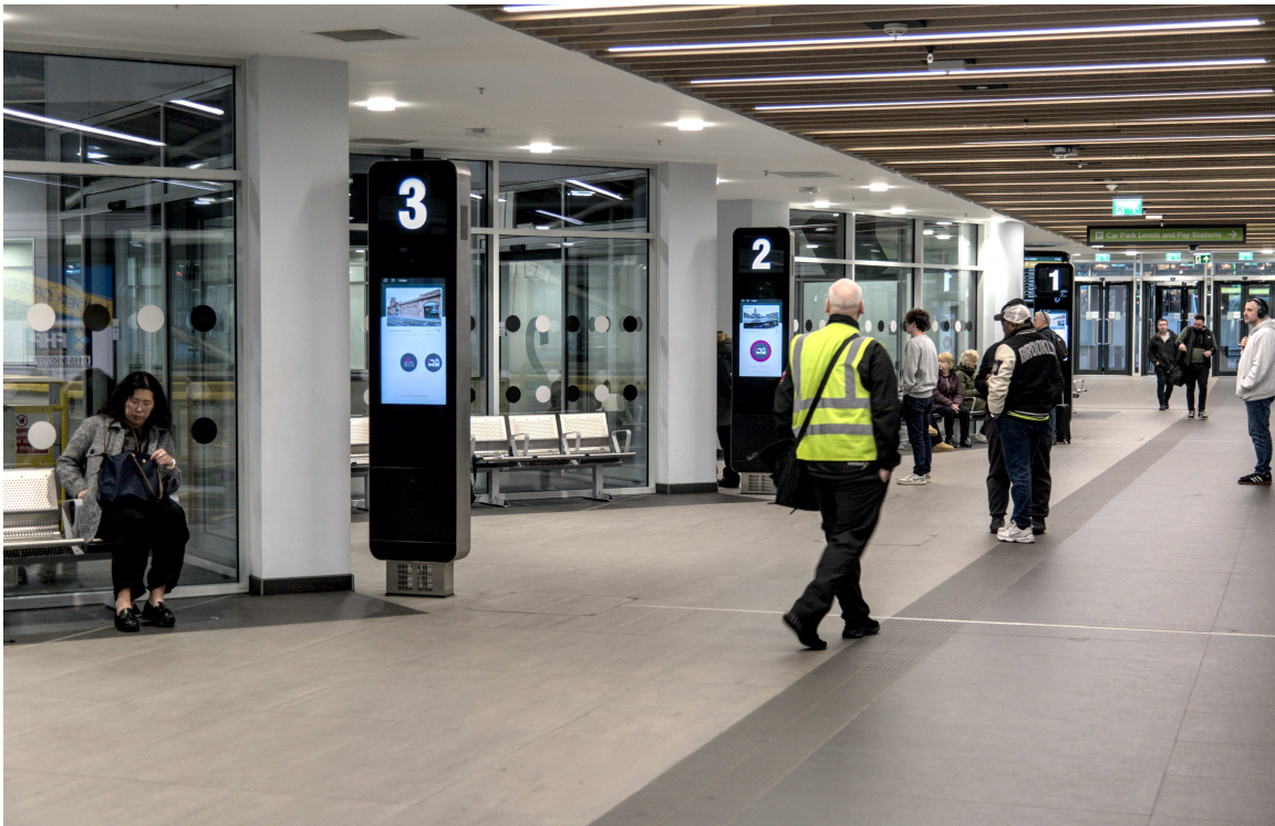
F47B0625 - Bus station.