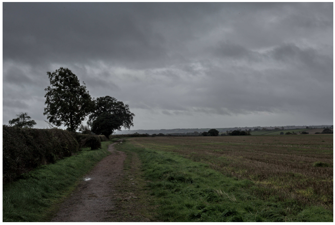
F47B7535 - Farm track.