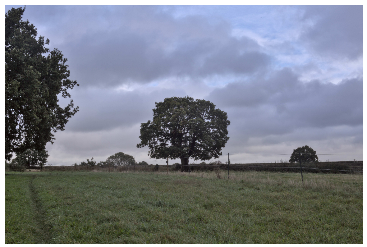
F47B7531 - A tree.