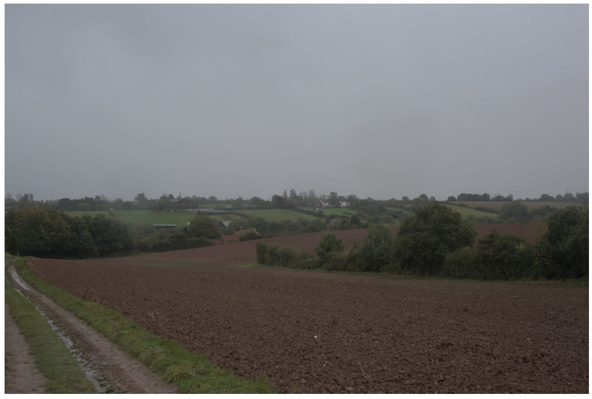
F47B7539 - Damp day in Nottinghamshire.