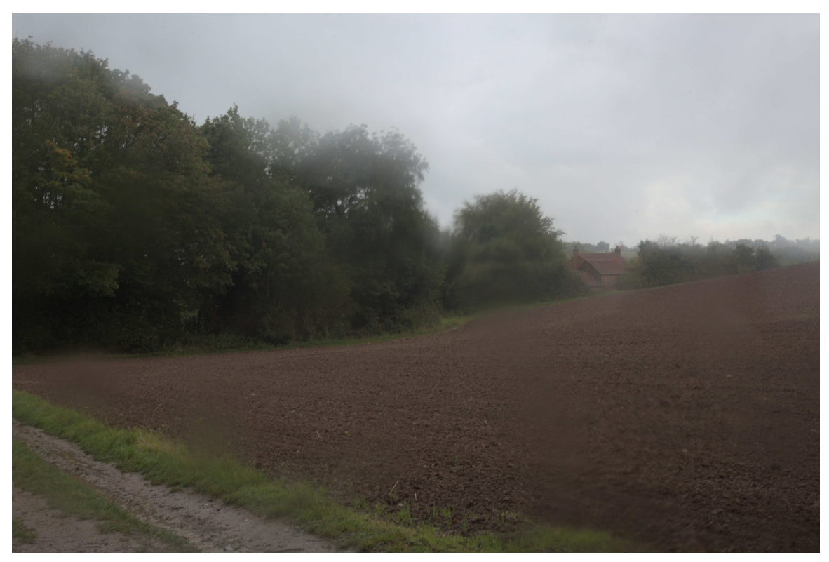
F47B7546 - House in country.