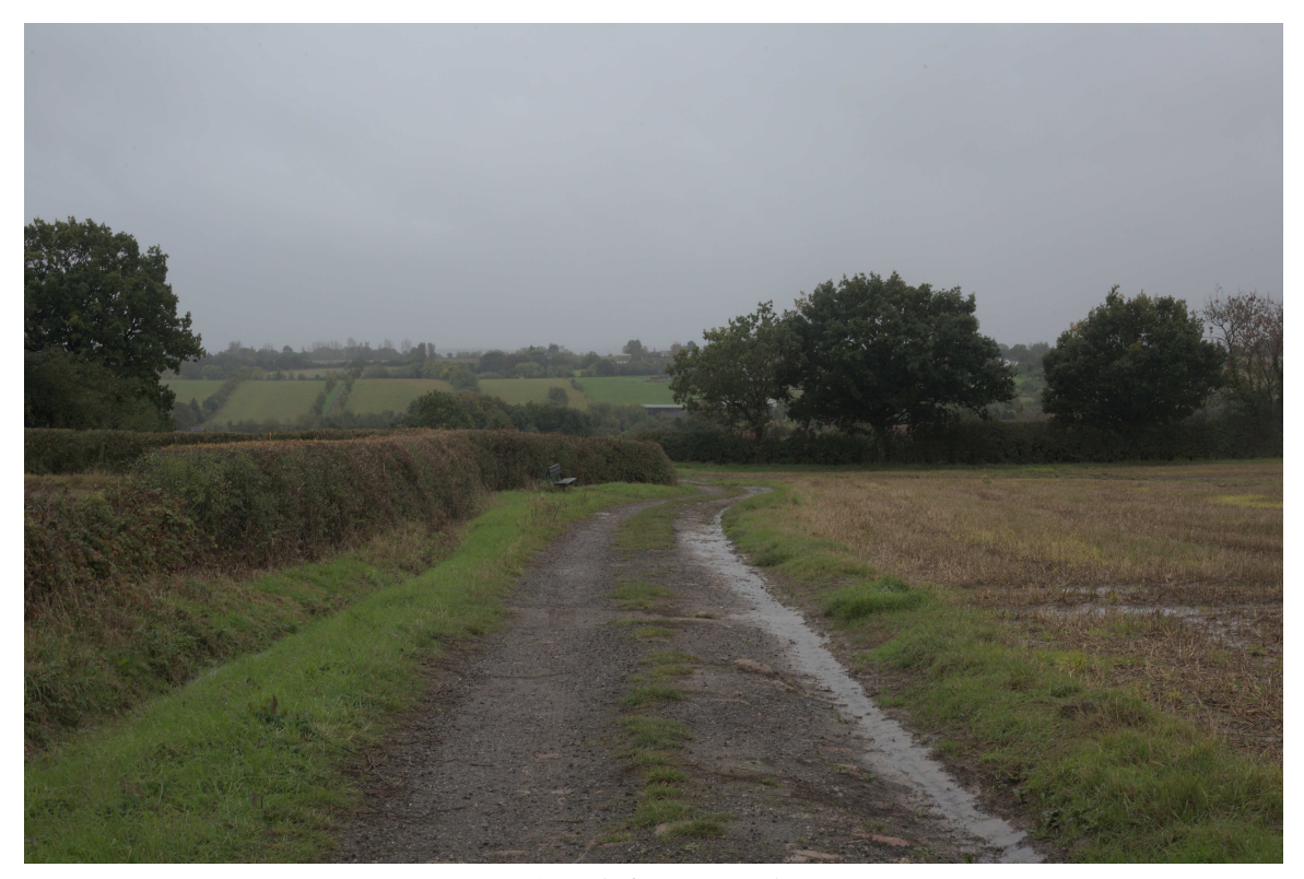
F47B7536 - Farm track.