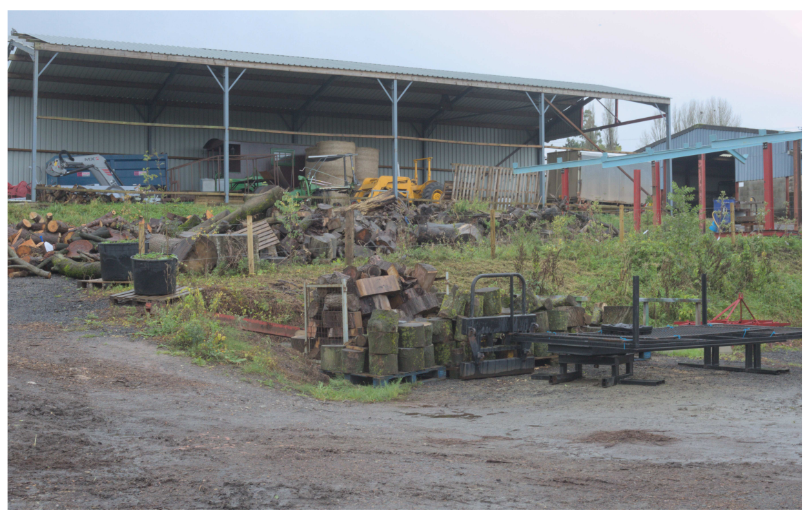
F47B7548 - Farm yard.