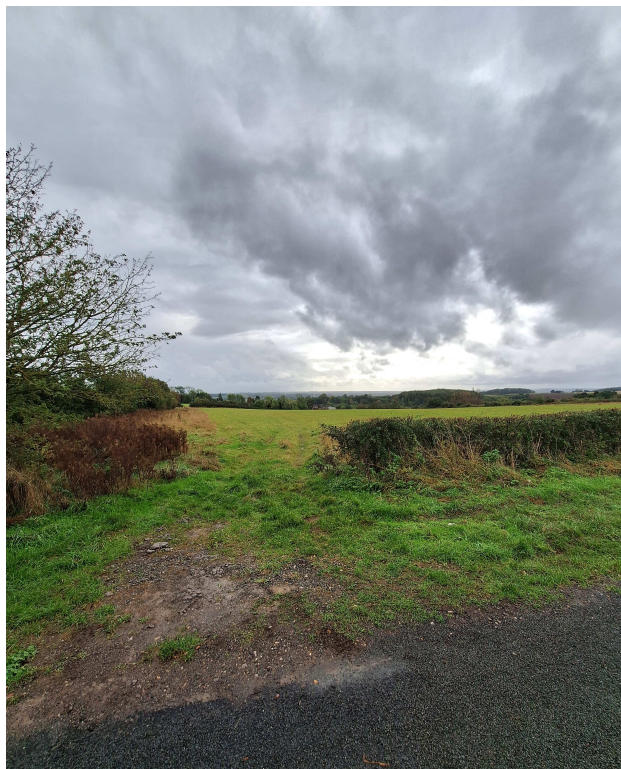
20231019_122419 - Country walk.

20231019_122419 20231019 12:24:19 Country walk. 20231019_122428 20231019 12:24:28 Country walk. 20231019_122449 20231019 12:24:49 Country walk. 20231019_122512 20231019 12:25:12 Self portrait on a country walk. 20231019_122716 20231019 12:27:16 Country walk. 20231019_122733 20231019 12:27:34 Country walk. 20231019_122735 20231019 12:27:35 Country walk. 20231019_122737 20231019 12:27:37 Country walk. 20231019_125258 20231019 12:52:59 Dropping down to Lambley..